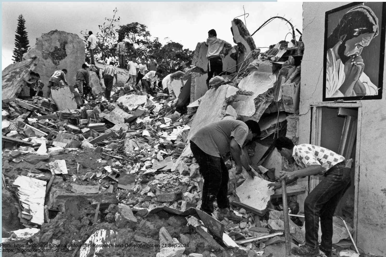
FIGURE 2 How can Catholic faith coexist with violent conflict? Tidying up after combat in San Luis, Antioquia, 1999.

PS: When I work with indigenous communities and talk with them about their problems and their plans, they usually preface