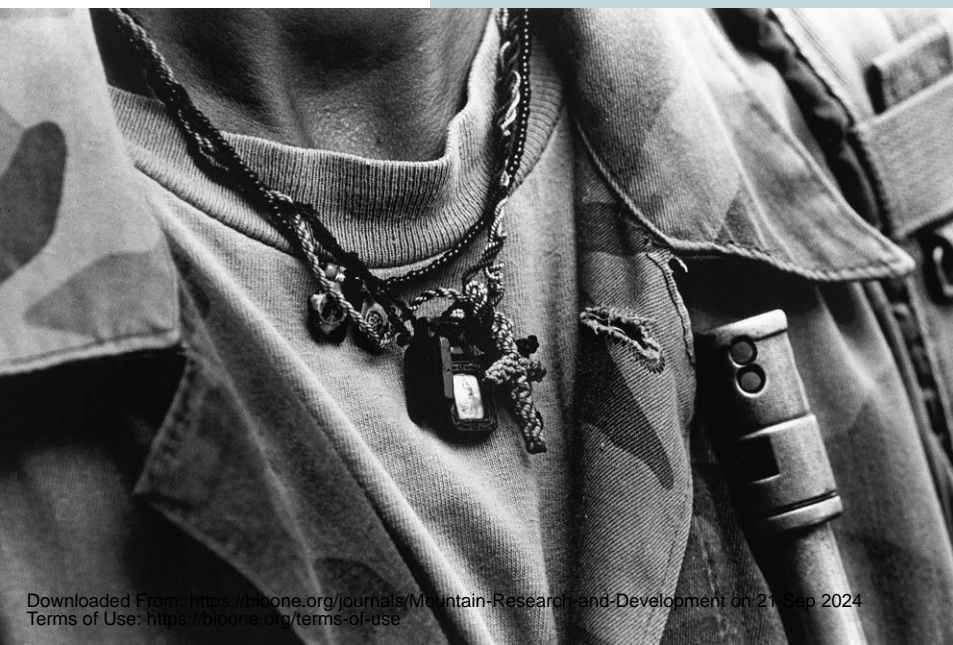
FIGURE 4 An armed guerrilla with Christian symbols of good luck. Achí, Bolívar, 1994.

their lengthy explanations with a remark such as, “Indigenous people like us, who have defended and preserved our identity against foreign invaders for more than 514 years...” This brings 2 of the 3 foundations of their spirituality into play: conscious memory of their long, collective history of oppression, and resistance, with its many victims. Their identity arises from this communal and historical consciousness. It gives them the strength to take action in present-day circumstances, and