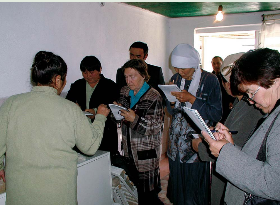
FIGURE 3 Exchange of experience between villages is the main idea of AGOCA: CAMP training in Swiss cheese-making technology for women in Akshi, Kazakhstan.

“Alpine experience has already been passed on to Central Asia. What started in November 2002 in Bishkek has already borne fruit. In the Caucasus region a first step towards a transboundary community network was taken, together with an initial eight pilot communities from four countries: Armenia, Azerbaijan, Georgia, and the Russian Federation. Cooperation between three mountain regions—the Carpathians, the Caucasus, and Central Asia—and other regions could generate