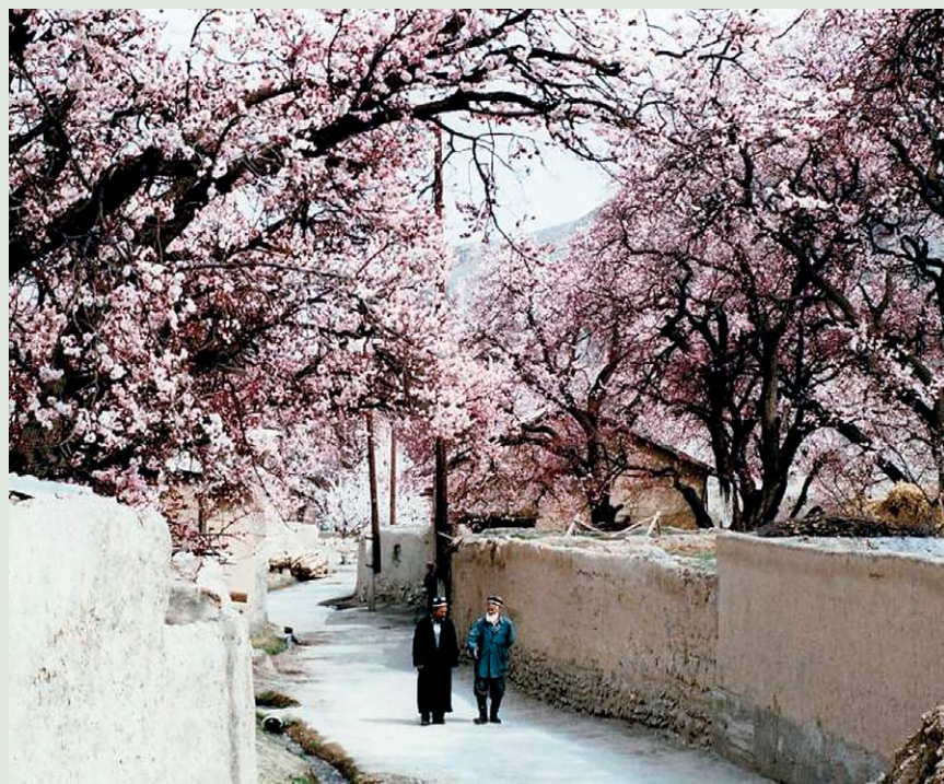
FIGURE 4 Hodjai-Ailo village, famous for apricot production and full of innovative ideas related to this rich potential, is a member of AGOCA in Tajikistan.

munities. Even if AGOCA represents a good incubator of local and innovative initiatives (Figure 4), we are still far from meeting the second expectation.