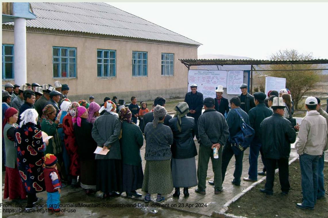
FIGURE 2 The main instrument and potential of TPSs (normally represented by a limited number of active people) is their ability to mobilize the majority of the village population when the need to discuss and solve different problems arises. Jergetal village, Kyrgyzstan.