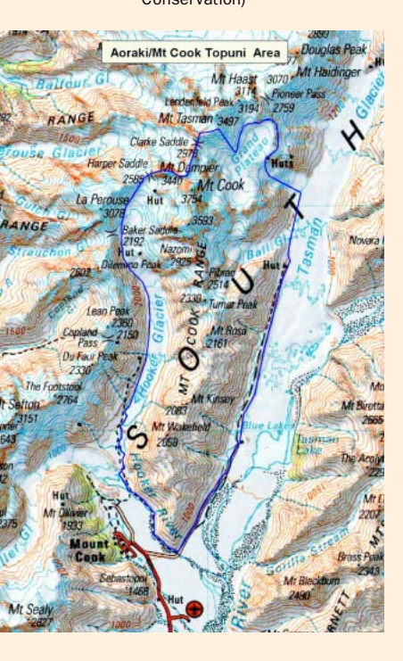
FIGURE 4 Map of Aoraki/Mount Cook topuni area.