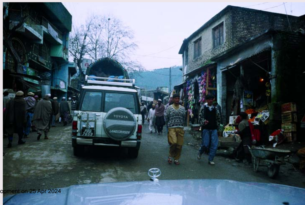
FIGURE 2 With the increase in tourism, the demand for comfortable air-conditioned transport facilities has also increased, at the expense of local transport businesses that cannot afford such costly vehicles.

"We do not get anything out of tourism in our areas. We do only small jobs for daily wages, which we of course could get in big cities. They use our areas and give us peanuts." (Muhammad Ali Khan, Swat Valley, September, 2001)