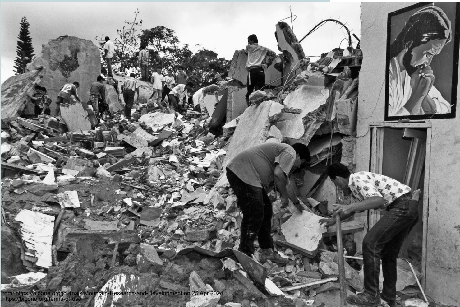
FIGURE 2 How can Catholic faith co-exist with violent conflict? Tidying up after combat in San Luís, Antioquia, 1999.

PS: When I work with indigenous communities and talk with them about their problems and their plans, they usually preface