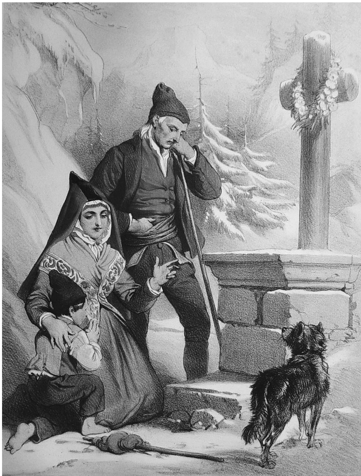
FIGURE 3 "A family in Barèges" (Vallée de Barèges, Central Pyrenees, France). Mid-19th century representation of a very conventional scene with unconventional costumes: Pyrenean society is imagined as Arcadia. This saint-sulpicienne picture (like the pious imagery and statuary selling in the shops around the church of Saint-Sulpice in Paris) represents a pretty young woman who drops her spindle to teach her child—barefoot in the snow—how to pray. A shepherd, with his crook and sheepdog, is more meditative than pious. Thus it is the mother who transmits belief in God. Why was the cross erected—to commemorate a dramatic event or remind passers-by of God? (Lithograph by Alfred Dartiguenave)