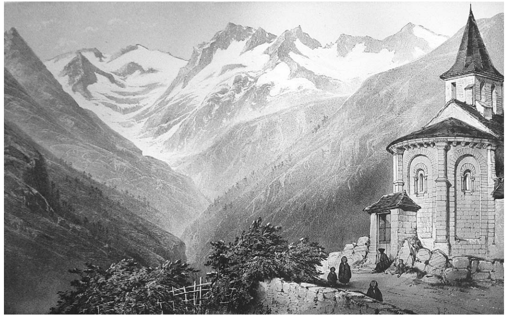
FIGURE 1 “Glaciers of the Valley of Astau” (Valley of Larboust, Central Pyrenees, France). A mid-19th century representation of a church in the mountains that combines romantic elements (a sense of the sublime) and realism (women, children, and 2 beggars on the church doorstep). This would have made the picture meaningful to both wealthy summer tourists and local inhabitants. (Lithograph by Victor Petit)