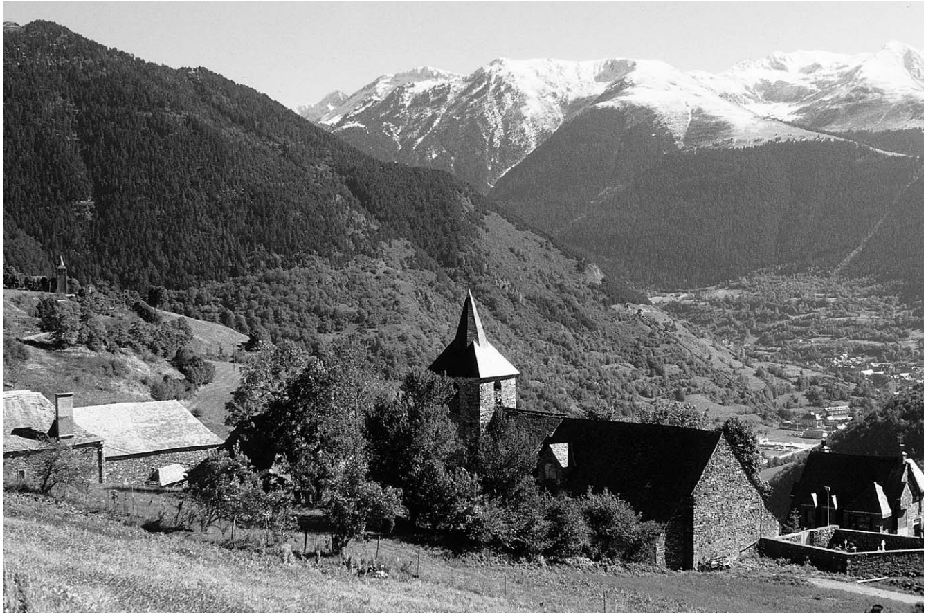
FIGURE 5 The village of Montcorbau (Valley of Aran, Central Pyrenees, Spain). In 1278, the villagers built a fortified bell-tower to protect themselves from feudal lords and the French bishop of Comminges. They kept all tithes to maintain the church and provide their priests with an income.

local credit systems and as notaries. All these phenomena testify to the embeddedness of the priests in the surrounding society before the Catholic Reformation promoted their separation from the laity (Gomis 2000, 2006). Despite more rigorous diocesan control and the decreasing number of clergymen, family strategies continued to play a role, though proceeding in other ways, during the 17th and 18th centuries. New seminaries (priest schools) and new educational obligations for practicing priests made the training of priests more expensive. The families, however, created ingenious modes of transmitting patrimonial titles within households (Cabanel 1997).