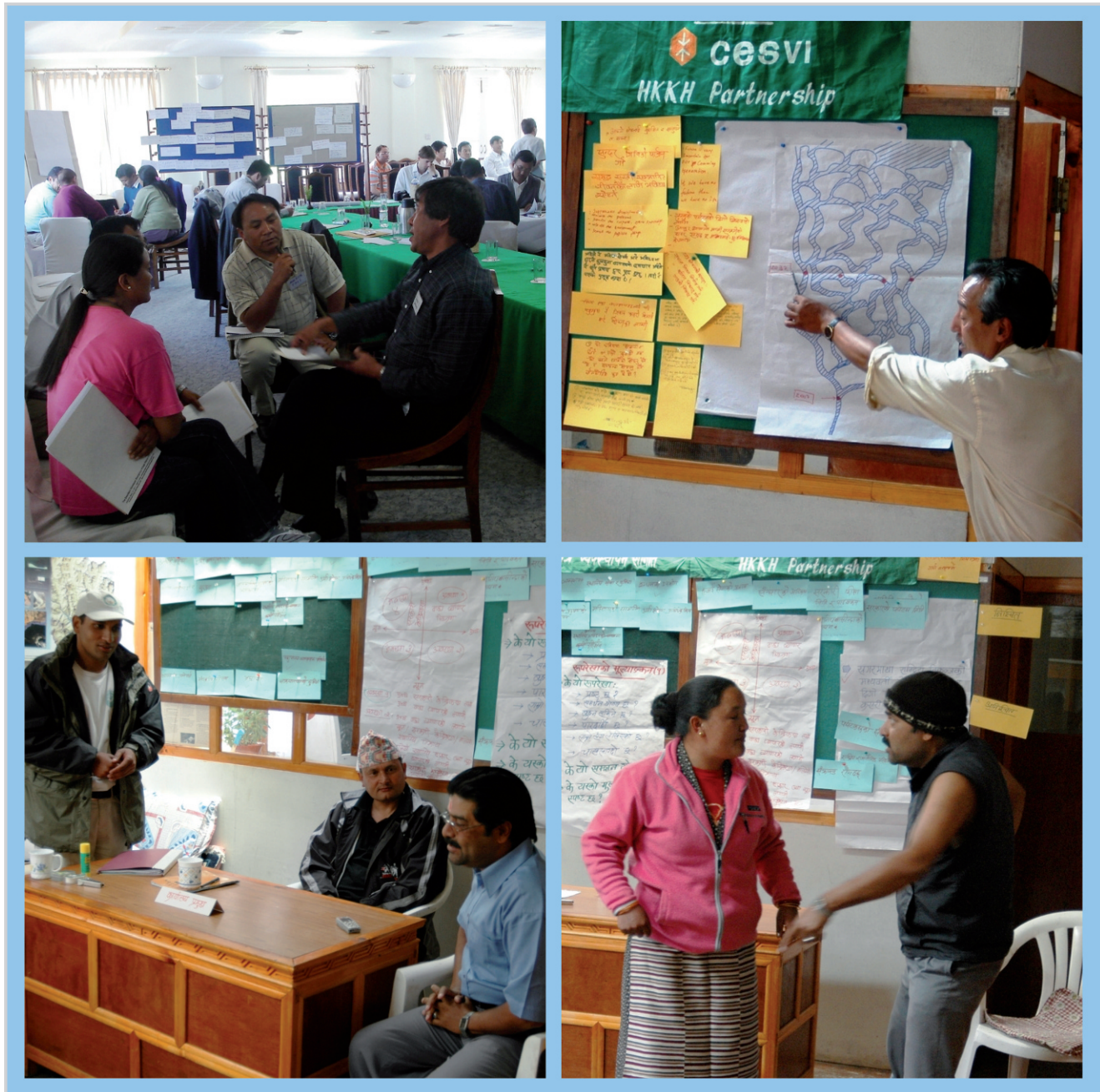
FIGURE 3 Clockwise from top left: (1) Scenario group work with tourism industry and NGO experts during the first workshop; (2) we presented the growing uncertainty of future park states and trajectories as sequential points along a braided river channel; (3) during our second scenario workshop, an actor plays a rogue community member as a metaphor for loss of local social norms; (4) in another dramatized scenario, an outside businessman tries to influence local park officials.

strongly supported park management devolution and local self-governance. However, discussion of the “autonomous Khumbu” scenario surprisingly revealed that participants did not have full confidence in local