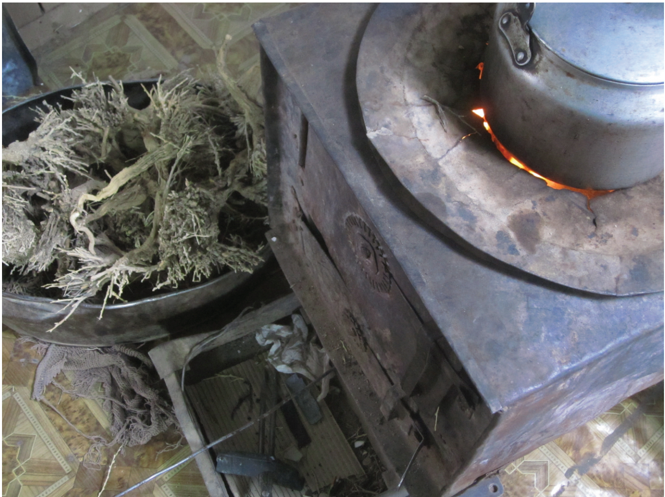
FIGURE 6 In Murgab town, it is mainly poor households that dig out teresken shrubs and fire them in the stoves for heating and cooking.

by poorer households and households in the villages that surround Murgab. Thermal insulation can only be part of an integrated strategy to solve the energy crisis in the Eastern Pamirs. In addition, the provision of alternative fuels (firewood, coal, gas, solar energy, and hydropower) and the dissemination of energy-efficient technology (heating and cooking stoves for winter, cooking stoves for summer) are necessary.