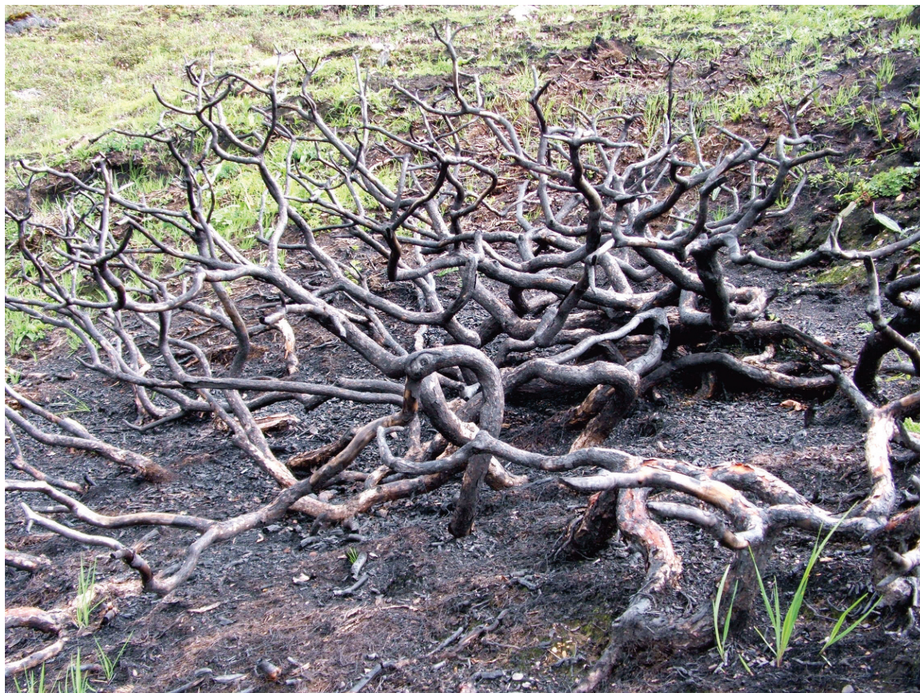
FIGURE 1 Rhododendron shrubs above 4100 m altitude at Soe Yaksa after prescribed burning.

prescribed burning can lead to 4.5 times as much carrying capacity as cutting or no treatment. The estimated carrying capacity after prescribed burning was also higher than the 0.10 livestock unit per hectare previously estimated for high-altitude regions (Dorjee 1986).