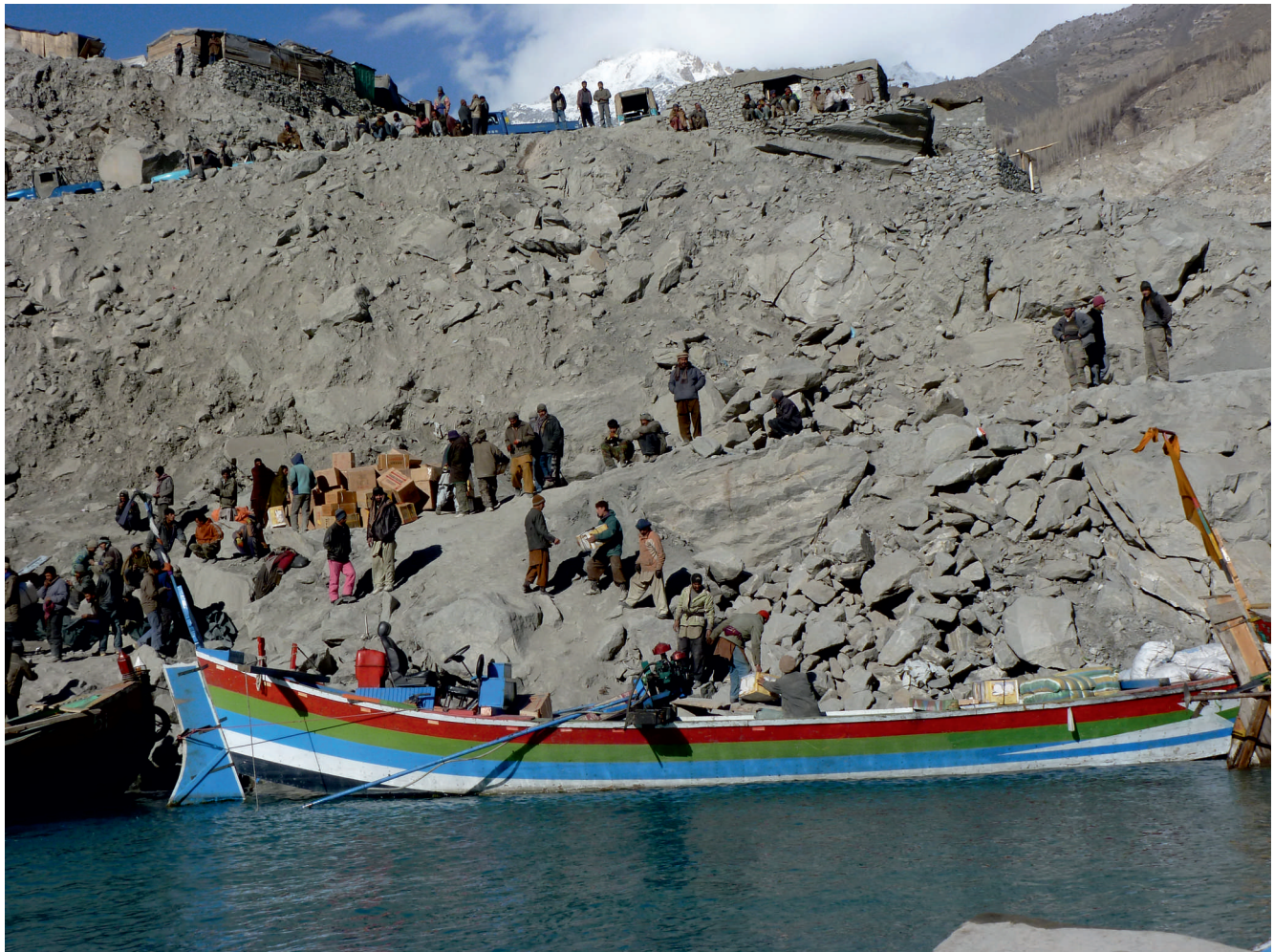
FIGURE 4 Boat passengers disembarking at Atta Abad landslide deposit. (Photo by David Butz, November 2012)