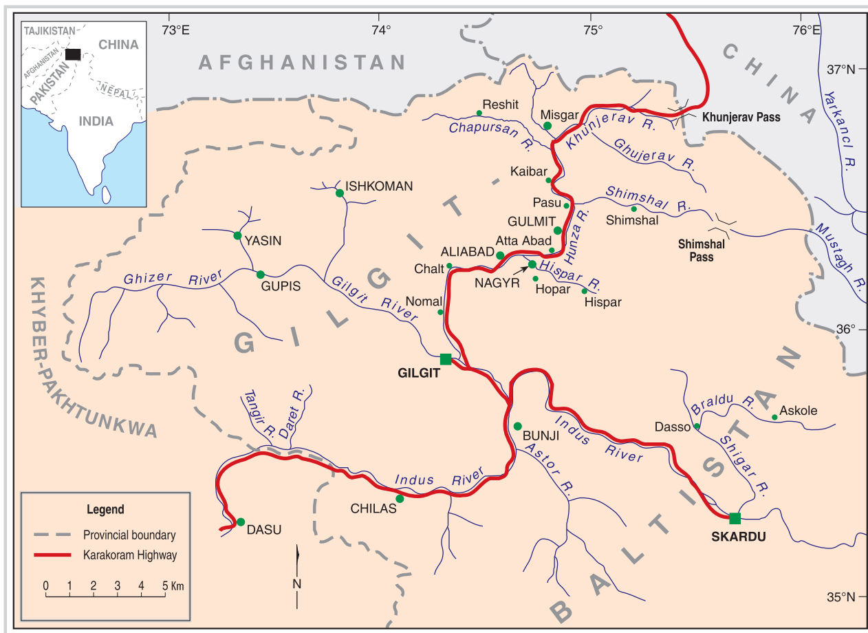
FIGURE 1 Gilgit-Baltistan, Pakistan. (Map by David Butz)

become reliant on the fast and cheap mobility afforded by an all-weather road.