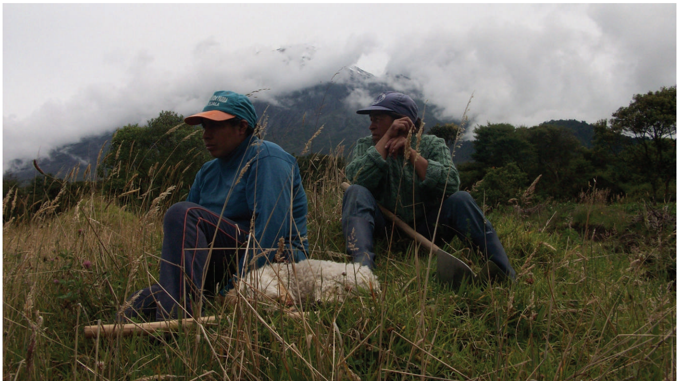
FIGURE 4 Two women in a minga work party take a break from repairing an irrigation canal. Mount Tungurahua can be seen partially obscured by clouds behind them.

The findings from this study can inform mountain development and disaster resettlement and recovery strategies elsewhere, though they do not point to any