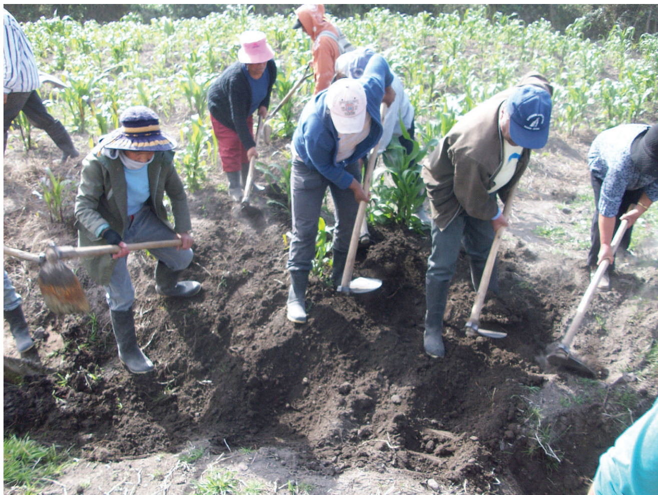
FIGURE 2 Resettlers in a collective work party ( minga ) rebuilding an irrigation network in the high-risk zone at the foot of the volcano. Minga is one of many forms of cooperation and reciprocity practiced in the area.