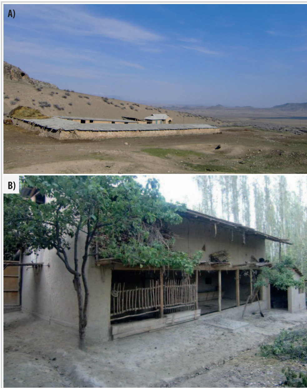
FIGURE 2 (A) The winter shed of a large-herd owner on the winter pasture site; (B) a herder's winter shed on his household plot. (Photos by Munavar Zhumanova, fieldwork 2014–2015)

socioeconomic and individual-level differences between both groups are presented in Table 1.