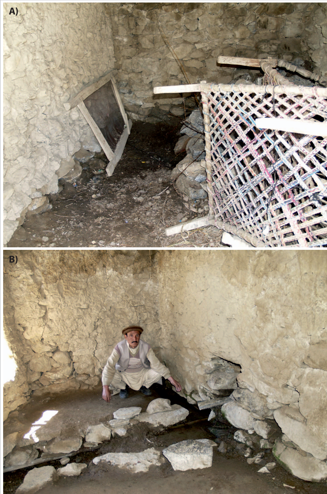
FIGURE 3 (A) Seepage inside a house located below an irrigation channel; (B) cracks in a house as a result of heavy seepage.