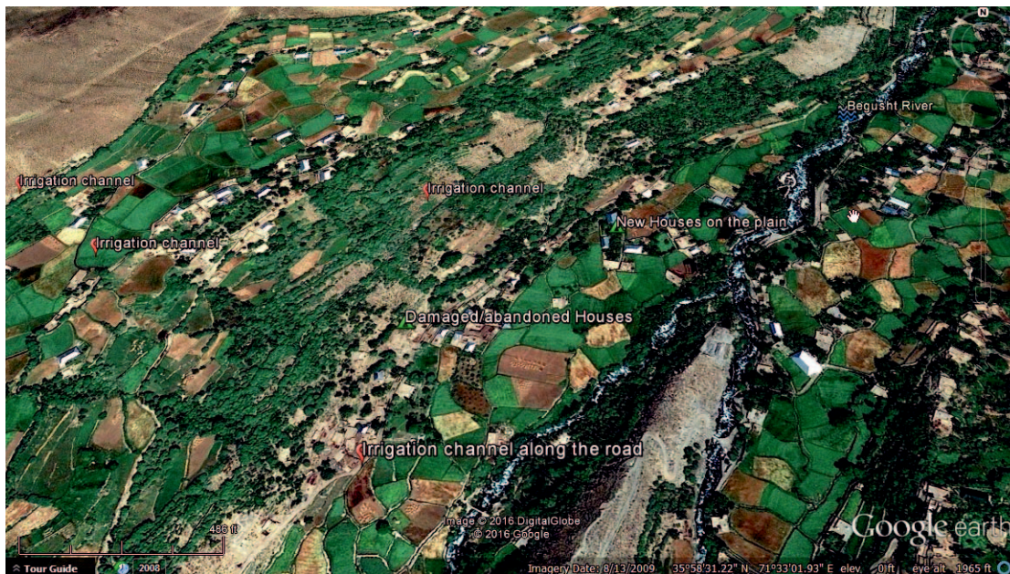
FIGURE 2 A Google Earth image of village Yourjogh. (Figure by Muhammad Abbas Qazi)

Project has also supported the improvement of irrigation channels. Helvetas Swiss Intercooperation Pakistan, supported by the Swiss Agency for Development and Cooperation, has also provided technical and financial assistance for improving old channels in Yourjogh and has organized a water users' association to manage these channels. While all these development initiatives have been implemented with the best of intentions, the hazard of landslips continues to rise in Yourjogh, for several reasons discussed in the following section.