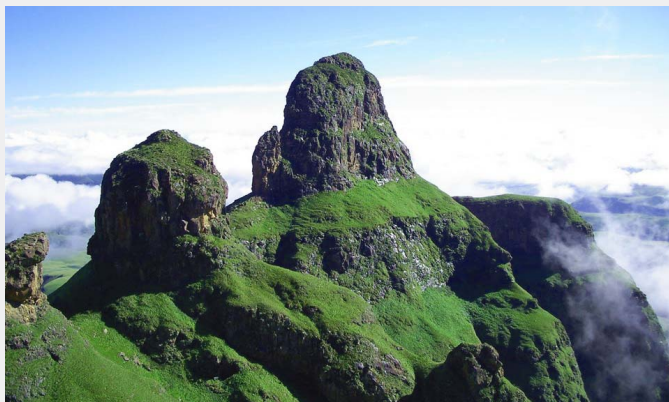
FIGURE 3 The ARU welcomes collaborations and partnerships to study southern African mountains as social–ecological systems and to achieve a science–policy–action interface for their sustainable development. (The Camel, ~2800 m, Cathedral Peak Area, uKhahlamba–Drakensberg Park and UNESCO World Heritage Site)

The ARU welcomes collaborations from across southern Africa, the Africa continent, and globally that align with our vision and mission and seek to partner with us to achieve our objectives for a sustainable future for southern African mountains (Figure 3).