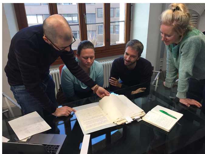
FIGURE 4 Postdoctoral workshop of 22 January 2020 at the Valais State Archives in Sion, Switzerland (Box 3). A historian (first on the left) shows to the natural scientists how to search and analyze archival data for mountain research.

policy toward a stronger support for inter- and transdisciplinarity (Taylor and Krause 2004; Sheate et al 2008; Bjørnsen Gurung et al 2012; Gleeson et al 2016). Thus, the criteria used to evaluate applications for academic positions and research projects should be revised at the level of research centers, universities, and national and international funding schemes.