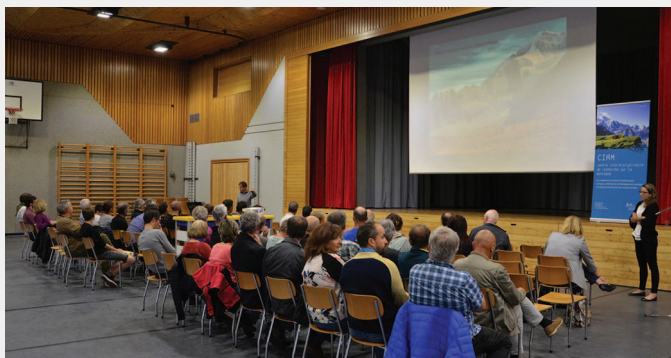
FIGURE 2 Conference on permafrost-related risks in mountains organized by CIRM in the village of Evolène, 13 June 2019.

transdisciplinary dialogue (see Otero et al, submitted, for an in-depth evaluation).