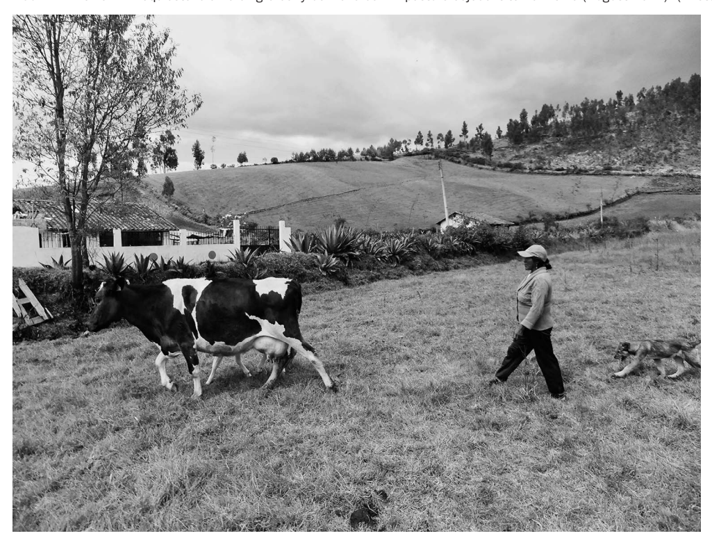
FIGURE 1 Woman in Paquiestancia herding a dairy cow and calf in pasture adjacent to her home (August 2014).

other communities involved with FONAG in Cayambe cantón.