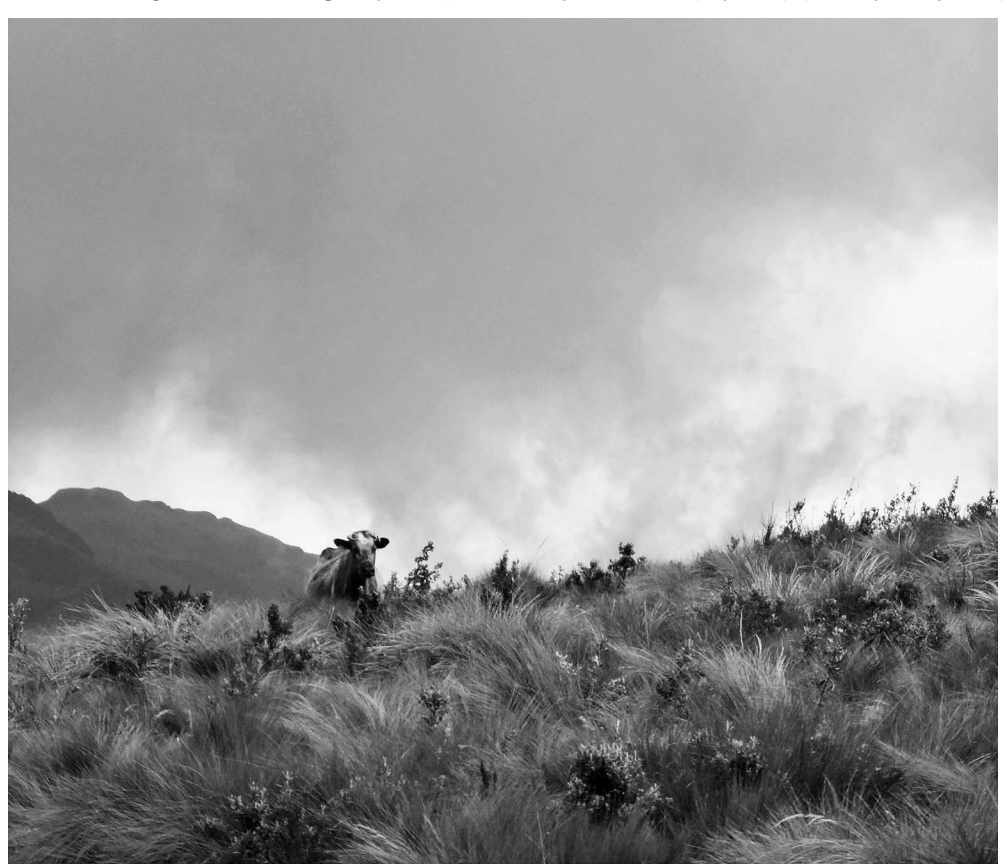
FIGURE 2 A lone ganado bravo roaming freely in the páramo on Cayambe volcano (July 2012).

supported projects in various communities in the region to improve and intensify dairy production. In Paquiestancia, this included a proposal for a pasture-seeding program to allow more intensive grazing on smaller properties near homes at lower elevations (FONAG 2011). In other Kayambi communities, it has included the support of improved pastures as well as veterinary care.