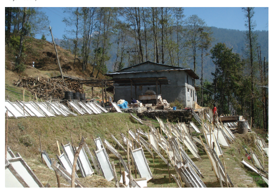
FIGURE 3 Bhimeshower Handmade Paper enterprise situated at Boch, Dolakha.

In the case of Mahadevthan, district-level traders purchased NTFPs from the village traders and sold them to Kathmandu-based traders or enterprises. However, they did not do this regularly; therefore, the village traders did not buy them when there were financial constraints or a lack of demand. In such situations, trade in NTFPs could not take place.