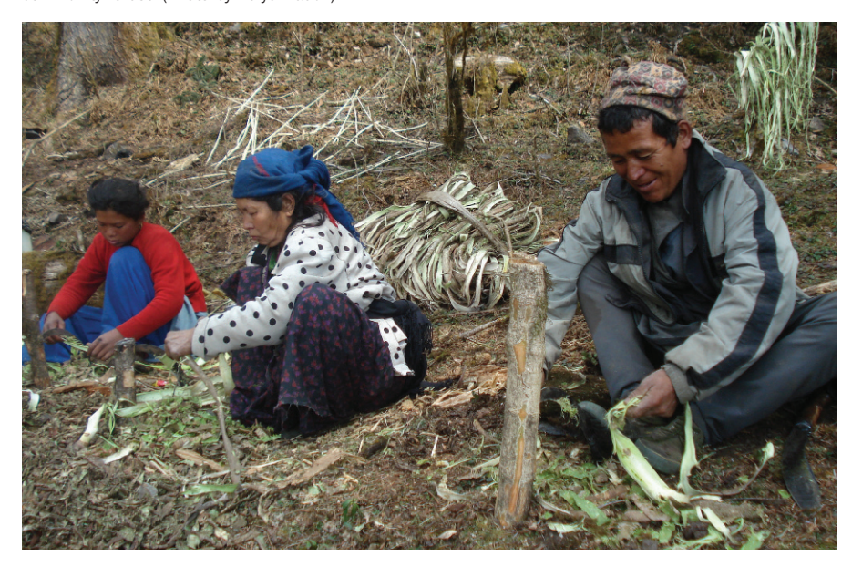
FIGURE 1 Nonmembers of Kalobhir CFUG cleaning lokta bark after harvesting from Kalobhir community forest.