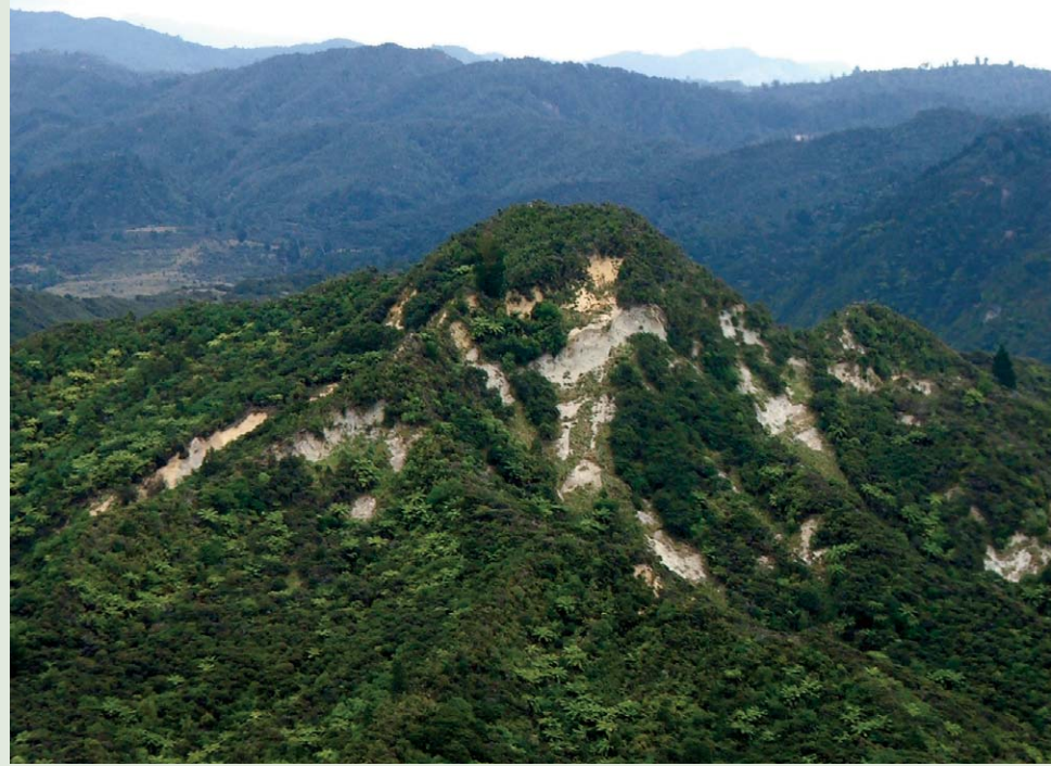
FIGURE 2 Hill-country erosion is a serious problem in the East Cape region, but reforestation can improve soil stability.

Māori landowners. At the outset, part of the project funding was allocated to purchase credits from the farmers for the first Kyoto commitment period at a uniform price of NZ$15 (US$ 11.25) per ton of CO 2 e.