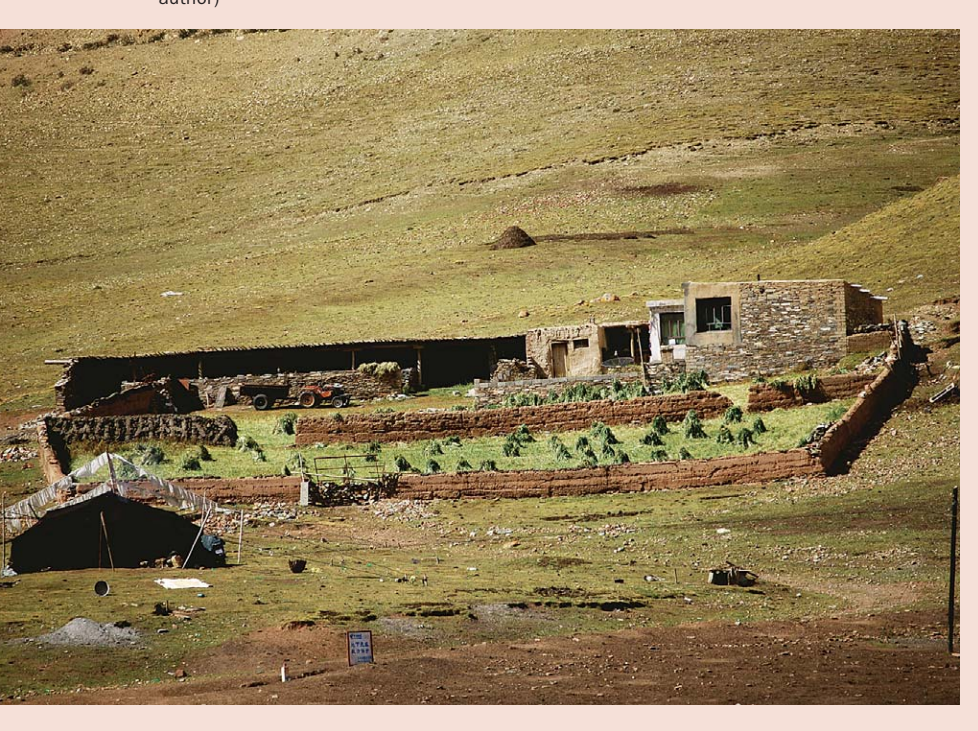
FIGURE 3 The "Rangeland to Grassland" policy: fencing is now being erected over vast areas of high-altitude grasslands. (Photo by author)

FIGURE 2 The "Four-Way Scheme" policy: a winter house, livestock shelter, fence (wall), and winter fodder are shown here, along with a traditional tent in the foreground. (Photo by author)