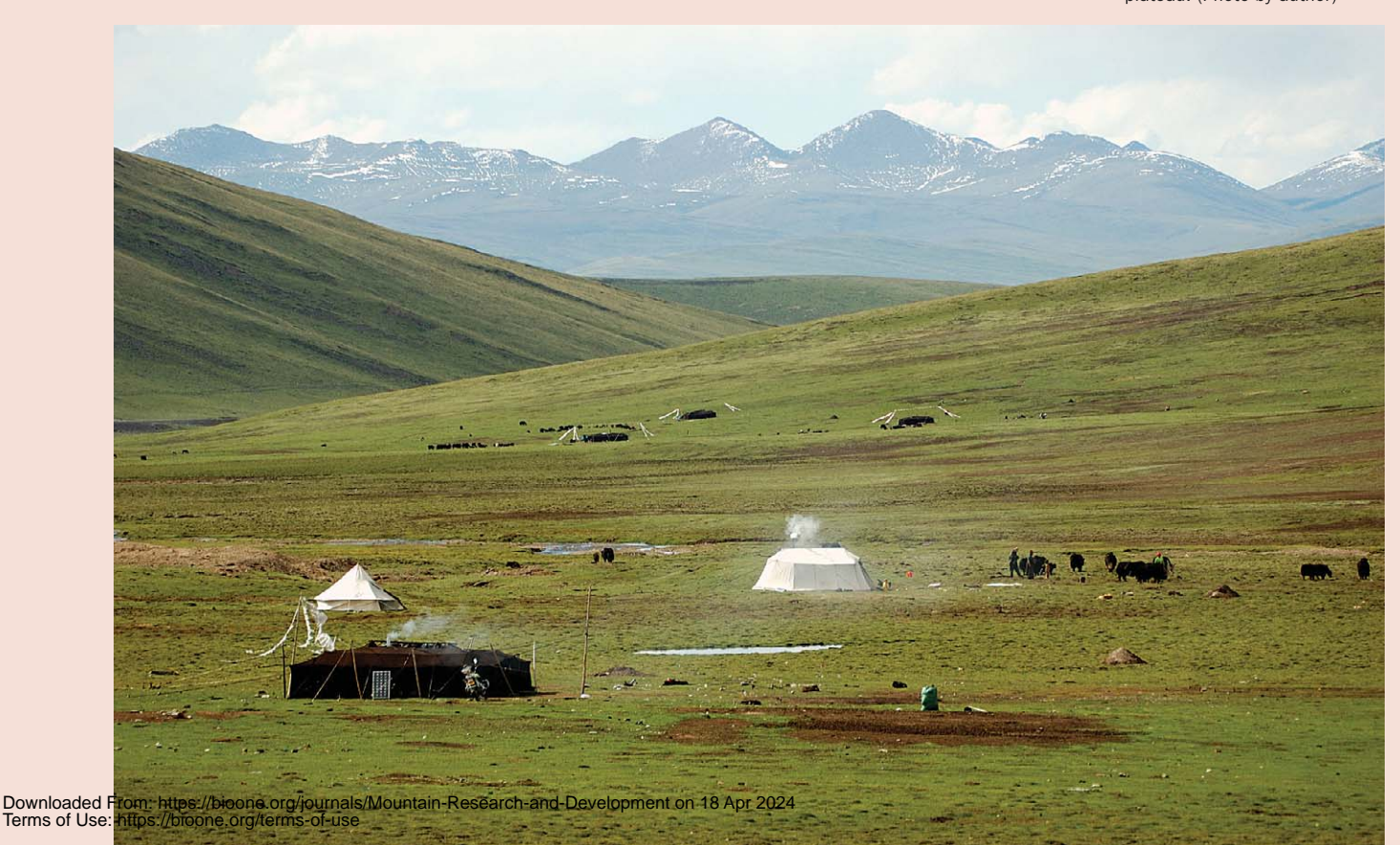
FIGURE 1 Pastoral landscape near the center of the Tibetan plateau.

Following a move in the 1980s to not intercede with newly emerging market forces—a decision that itself began a process of economic globalization even in the remotest parts of the country—several other strategic decisions also have been made at high government levels to integrate all regions of China, including ethnic minority areas such as the Sanjiangyuan region, within a centrally planned system. From a social perspective (ie from the pastoralists' point of view) anything beyond