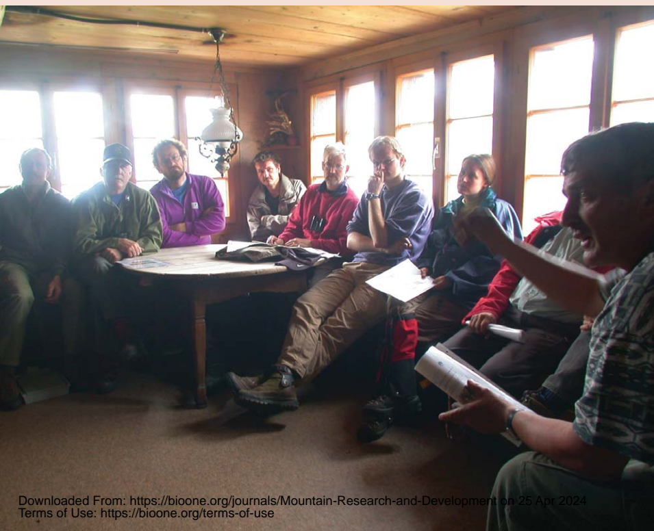
FIGURE 4 Stakeholders participating in the Stotzigwald Uri Platform discuss their joint development plan.