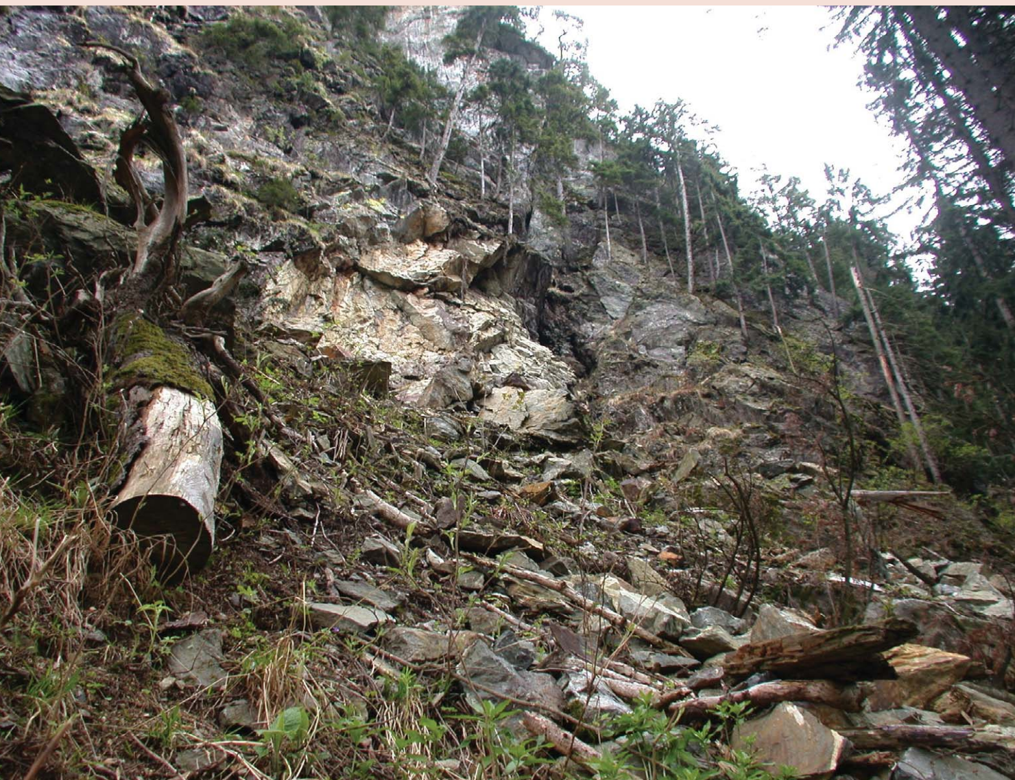
FIGURE 2 The protective function of the Stotzigwald ("very steep forest") is no longer assured: critical geological conditions and a lack of regrowth are destabilizing the forest system.

ers, farmers and forestry people, hunters and gamekeepers, conservationists, tourism operators, government offices at the local and cantonal levels, and researchers.