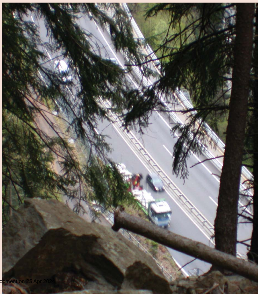
FIGURE 1 Rockfall threatens trans-Alpine transportation infrastructure.

not produced satisfactory results. It has been recognized that sectoral interventions cannot solve the forest vs game animal problem; uncertainty and disagreement continue to prevail about how to continue dealing with this problem. Faced with this challenge, representatives of a large number of regional and trans-regional interest groups started to meet. Amongst the most important in the Stotzigwald “action system” were landown-