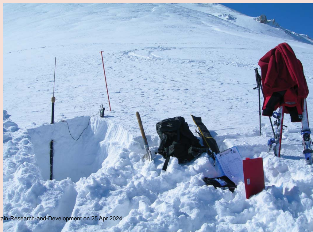
FIGURE 1 Sampling of snow layer for pH and electrical conductivity PROFILE determination in Prati di Tivo, Abruzzo, Italy.

Moreover, not only the quantity but also the quality of snow is changing. Looking deeply below and inside the white mantle, we are really surprised to find a rich content of particles, dust, and chemical/radiochemical compounds, with implications for the quality of meltwater and, consequently, for the health of people.