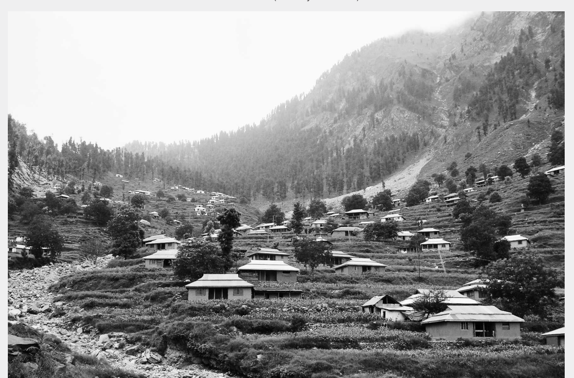
FIGURE 1 Lamnian Watershed in Pakistan-Administered Kashmir.

struck parts of Northwest Frontier Province (NWFP) and Pakistan-Administered Kashmir (PAK) in the northeast of Pakistan, causing 80,000 casualties. FAO supported the development of a livelihood component for the postemergency rehabilitation plan of the Earthquake Reconstruction and Rehabilitation Authority (ERRA). This component was presented to the Swedish International Development Cooperation Agency (SIDA), which agreed to support its implementation. This intersectoral initiative has a threefold focus on improvement of local livelihoods, institutional capacity building, and control of hydrogeological hazards through collaborative watershed management at the village level. The project is being implemented by ERRA in collaboration with several departments of FAO. The project started in March 2007 and will continue at least until December 2009. Strengthening the capacity of ERRA