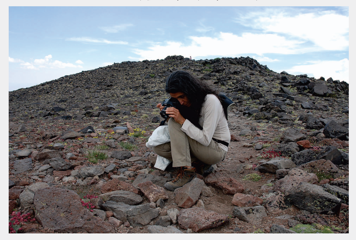
FIGURE 2 Photos can be an important source of knowledge about the dynamics of socioecological systems in mountains. A forest ecologist from Ecuador documents the scattered flora on Mount Rose (NV), USA, in July 2014.

more data, much of which will probably also be common to the other three Concerted Efforts.