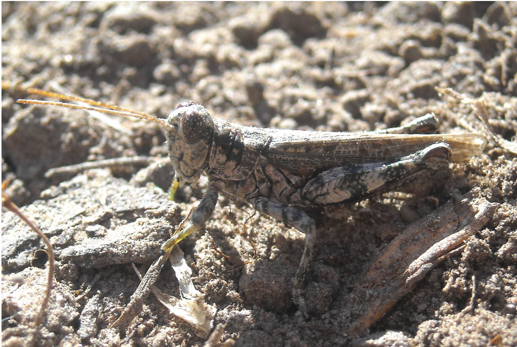
Fig. 5. Male Melanoplus punctulatus photographed on soil of campground trail at Chadron State Park.

ash throughout the Great Plains, or if it associates with other plant species. The specimen from Richardson County in 2008 was collected from the trunk of an oak ( Quercus sp.) tree (Brust et al. 2008), and we found them on hackberry and wild grape (see above).