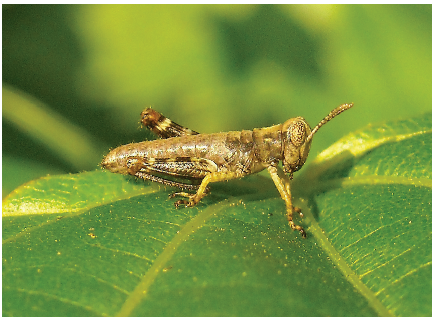
Fig. 2. Second instar Melanoplus punctulatus , photographed on July 17, 2014 at Chadron State Park, elevation ~ 1060 m above sea level.

On September 2, 2014, we surveyed Monroe Canyon in Sioux County, Nebraska, which is about 80 km (50 miles) west of Chadron, Nebraska. Despite searching the trunks of over 50 green ash trees during ~ two hours, no M. punctulatus were found. Thus, Dawes County may represent the westernmost limit of M. punctulatus in Nebraska.