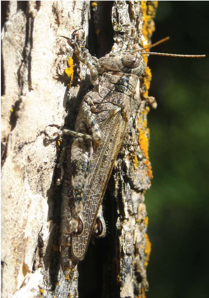
Fig. 3. Female Melanoplus punctulatus photographed at Chadron State Park on bark of green ash.

On October 14, 2014, we returned to Chadron State Park. By this date, the green ash trees had lost virtually all of their leaves. During a 30-min walk, 12 males and two females were collected and three additional females were observed, all adult. All were found on the ground, mostly along the edge of a trail. Two additional adult males were collected on October 18, 2014, along the same trail. A single adult male was also collected by H. R. Lawson on his garage door on the morning of October 15, 2014, approximately two miles east of Chadron near Little Bordeaux Creek. For a full listing of specimens collected and observed, see Table 1.