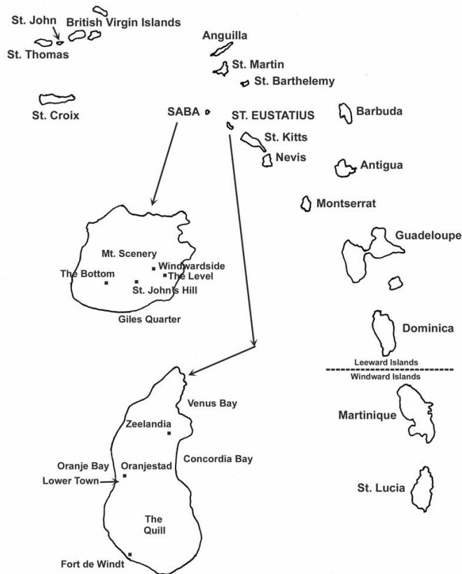
Fig. 1. Northern Lesser Antilles showing the location of St Eustatius and Saba. Insets of the islands illustrate the general collecting areas.

Additional orthopteran specimens, collected primarily in 1949 by Burgers and Hummelinck, were loaned from the Zoölogisch Museum Amsterdam (ZMA). Other specimens were obtained from the Academy of Natural Sciences of Philadelphia (ANSP) and the Zoologisk Museum, Copenhagen (ZMC). Specimens studied are deposited in ANSP, MNHN (Muséum National d'Histoire naturelle, Paris), UMMZ (University of Michigan Museum of Zoology, Ann Arbor), ZMA, and ZMC.