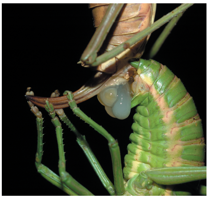
Fig. 1. A. Mating of Uromenus brevicollis . The male, which has produced the spermatophore, is upside down, and hangs under the female, the head of which is oriented upward. B. More detailed view.

Asphodel stems were collected at San Pellegrino (Penta-Di-Casinca, Haute-Corse, on 19 July 2006), at Pertusato (Bonifacio, Corse-du-Sud, on 21 July 2006) and at Biaggiola (Porto-Vecchio, Corse-du-Sud, on 22 July 2006). Two stems found at Pertusato were split lengthwise in order to count the number of eggs laid in each hole. We compared the pattern of laying in 30 stems of asphodels ( A. ramosus ) and the same in ferulas ( Ferula communis , Apiaceae) from samples taken at Bocca di Sant'Alparte, near the crossroad to Rovani (Coggia, Corse-du-Sud, on 31 July 2006).