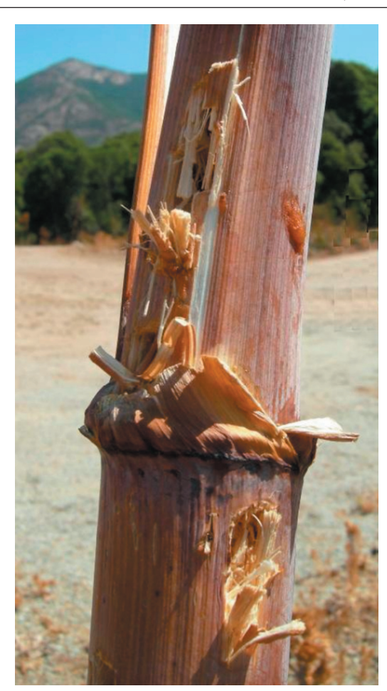
Fig. 3. Traces of attack on Uromenus brevicollis insularis laying sites by a woodpecker.

therefore, is the chance that a given male will meet a female on a given night? If the observed numbers are taken into account, there is about a 91% chance of meeting on a given night at the San Pellegrino site and 52% at the Biaggiola site. If the reproductive season lasts approximately 10 d, a male therefore has a high probability of mating.