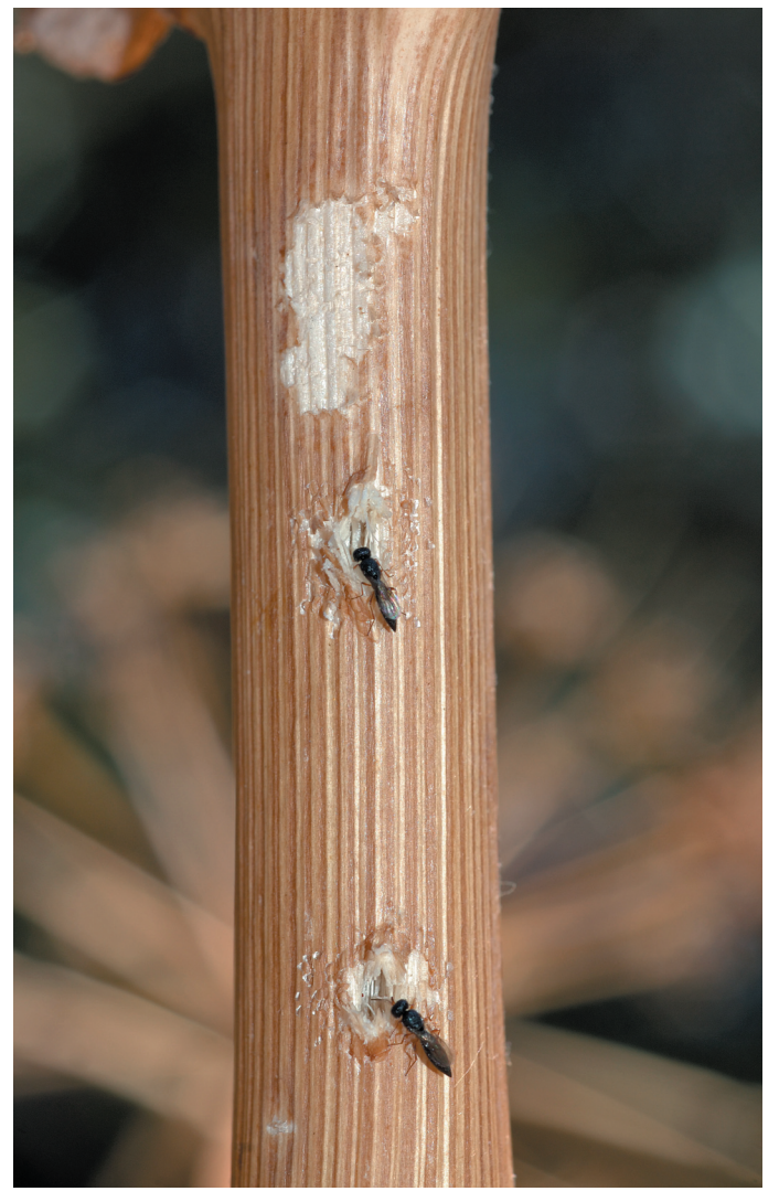
Fig. 4. Two females of a parasitoid scelionid wasp inspecting holes before laying in the eggs of U. brevicollis ssp. insularis.

Peyerhimhoff (1908) also mentioned Ferula sp. as a suitable