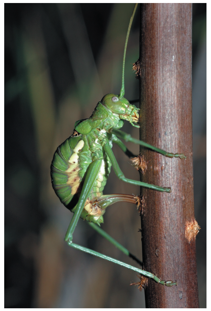
Fig. 2. A. Holes dug by female Uromenus brevicollis insularis in a dry stem of Asphodelus ramosus . The space between the successive holes is about 1.3 cm. B. Female U. b. insularis introducing her ovipositor and at the same time digging the next hole with her mandibles.

this is close to the number recorded in the abdomen of dissected females. The maximum number of holes dug during an oviposition bout was 26, corresponding to about 71 eggs. Again, there is a good match with the maximum observed in the female collected at Ponte-Leccia. Asphodels thus play a major role in the reproduction biology of U. b. insularis since we recorded a mean number of 64 \pm 32 eggs per stem at the sites where the insect is present.