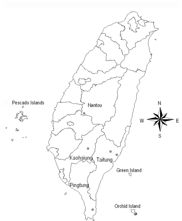
Fig. 13. Distribution of Alulatettix angustivertex , n. sp., in Taiwan. (○ = collecting localities).