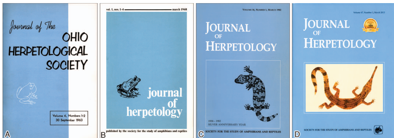
FIG. 3. Re-designed issues of the society's scientific journals. (A): Cover of major re-designed Journal of The Ohio Herpetological Society (vol. 4, nos. 1–2, September 1963); enlarged issue (64 pages in length and 7 \times 10 -inch format) with new society colors and frog logo. (B): Cover of first volume of Journal of Herpetology (vol. 1, nos. 1–4, March 1968 [published April 26]), new cover design but with same elements. (C): Modern journal format established (vol. 16, no. 1, March 1982); new cover design as well as text pages. (D): Page dimensions of journal increased to 8.5 \times 11 inches in 2011 (the current format size). This image of Tomistoma schlegelii appeared on all of the 2013 covers.