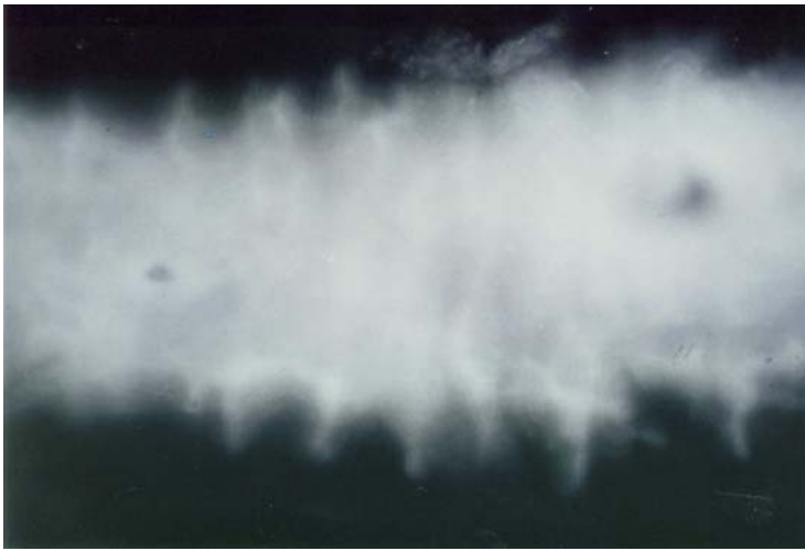
Figure. 1. Fluorescence intensity of midgut lumens of Chironomus luridus larva (untreated and without a tube), vital stained with fluorescein. The picture was taken while in peristaltic movement. Taken with fluorescent microscope at 100x.

fluorescent dye is shown in Fig. 1. The fluorescent dye fills the midgut lumen and does not penetrate other body compartments. Exposure of the larvae to copper causes cell injury that results in FLU penetration into larval organs. Following the exposure to copper, significant differences were found between high FLU penetration into larval organs in larvae without tubes, as opposed to low FLU penetration in larvae within silt tubes (Table 1). Significant differences were found in all the 5 examined body compartments and in all tested concentrations (Table 2). The average FLU intensity calculated for three tissue types (the larval body, gills, and Malpighian tubules) in the 50 mg/l treatment, as compared to tap water controls, was doubled in larvae in tubes, whereas it was elevated 36-fold in naked larvae (Fig. 2 c, d, e). When the copper concentration was elevated to 100 mg/l, permeability into all body compartments of the naked larvae decreased, while permeability into the various tissue types of larvae in silt tubes increased, as compared to the 50 mg/l treatment (Fig. 2).