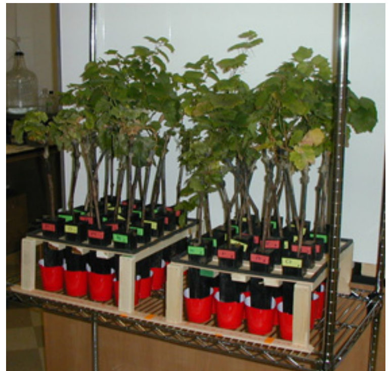
Figure 2. Transmission experiment plant arrangement. Note: a large rectangular cage was placed around the plants when insects were introduced.

When H. coagulata were initially exposed to a control plant under laboratory conditions, they usually established contact within 10 min followed by probing. H. coagulata exposed to plants treated with either dose of pymetrozine were much more agitated than insects exposed to control plants. While 94% of H. coagulata exposed to control plants established contact with the test plant for at least 10 min per hour, 81% of H. coagulata exposed to test plants receiving 0.0075 mg of pymetrozine per plant and 38% of H. coagulata exposed to test plants receiving 0.015 mg of pymetrozine per plant established contact (Table 1) (see video). Percent contact in all groups of H. coagulata was statistically different among treatments ( p < 0.001 ). The percentage of H. coagulata establishing contact with the host plants varied little over a 24 h period; however, differences among treatment groups were evident (Fig. 3). More than 90% of the control insects established contact with the plant.