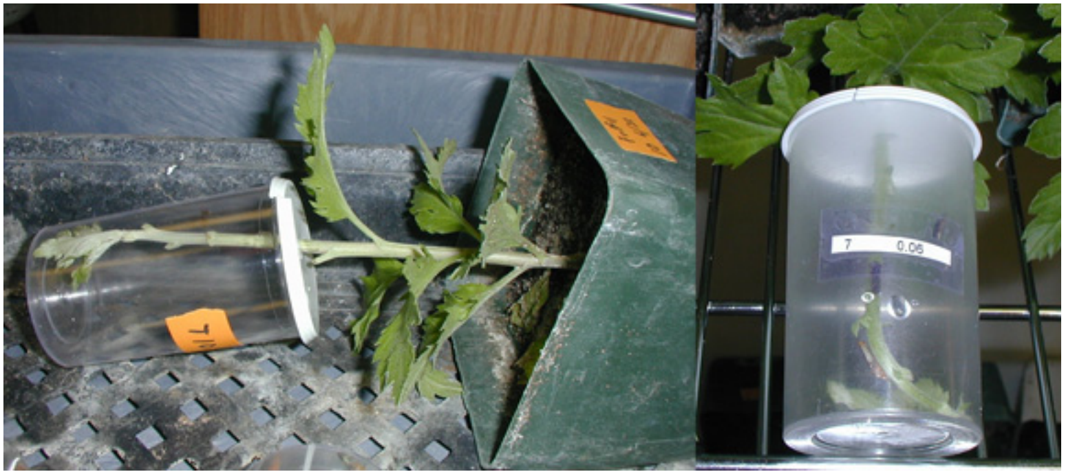
Figure 1. Homalodisca coagulata excreta study setup.

the humid box for 2 hours at 25° C. The plate was washed 6 times before adding 100 \mu l of o-Phenylenediamine solution per well and incubated for 15–30 minutes. The reaction was stopped by adding 50 \mu l of 3M sulfuric acid to each well. Results were evaluated by examining the wells using a Benchmark microplate reader (BioRad, www.bio-rad.com ) and analyzed using the BioRad Microplate Manager V. 5.1 build 75 software. Wells in which color developed to greater than twice the OD 490 of the negative control were considered positive. Test results were valid only if positive control wells tested positive and negative control buffer wells remained clear. Data were pooled between replications because no significant differences between dates were noted. Differences in rates of X. fastidiosa infections in grapevines receiving different doses were compared using ANOVA and LSD ( p = 0.001 ).