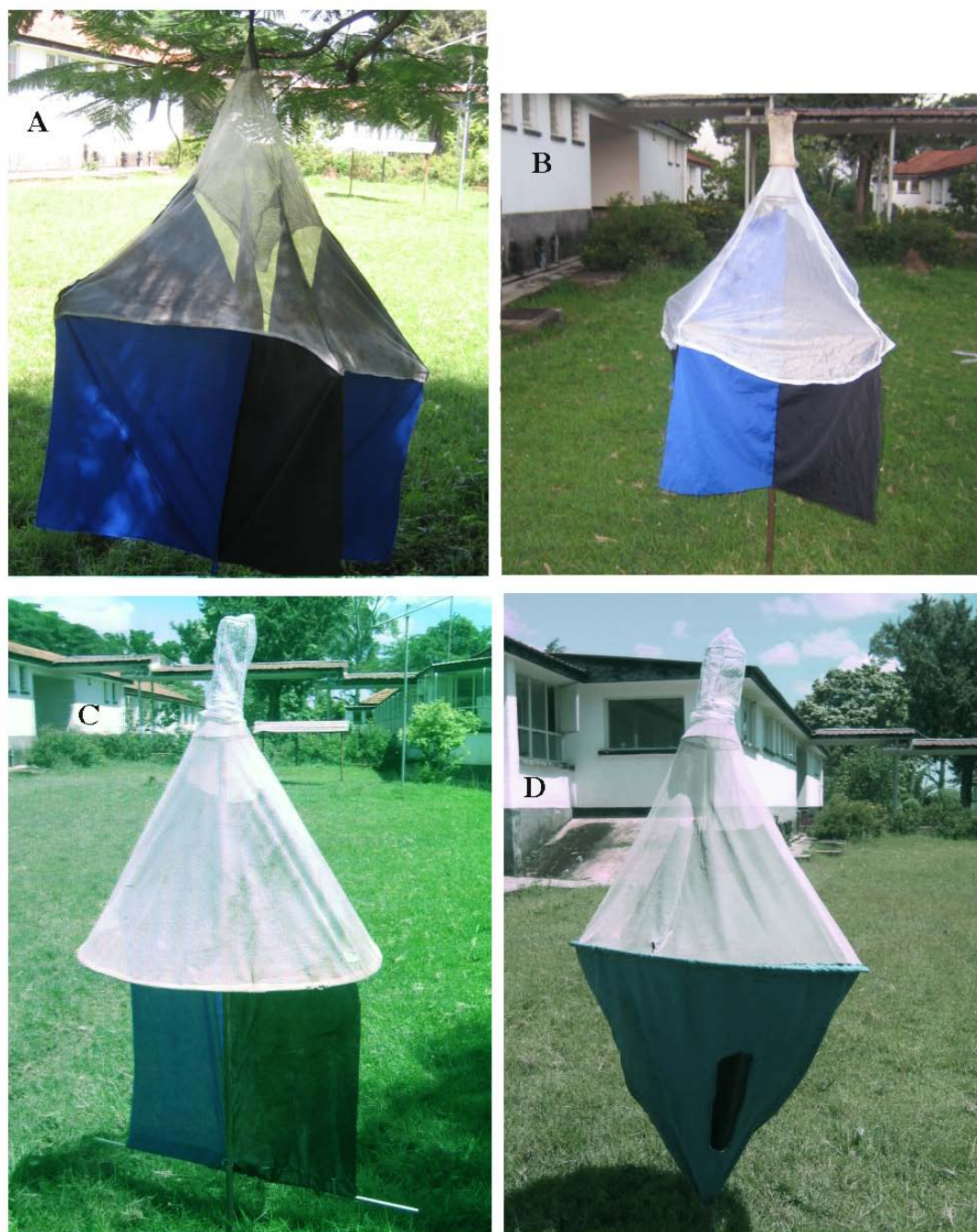
Figure 2. Photographs of the different trap designs that were tested. A) Pyramidal trap, B) Modified pyramidal trap, C) Monoscreen trap, D) Biconical trap.

with sustainability (Dransfield et al. 1991; Lancien 1991).