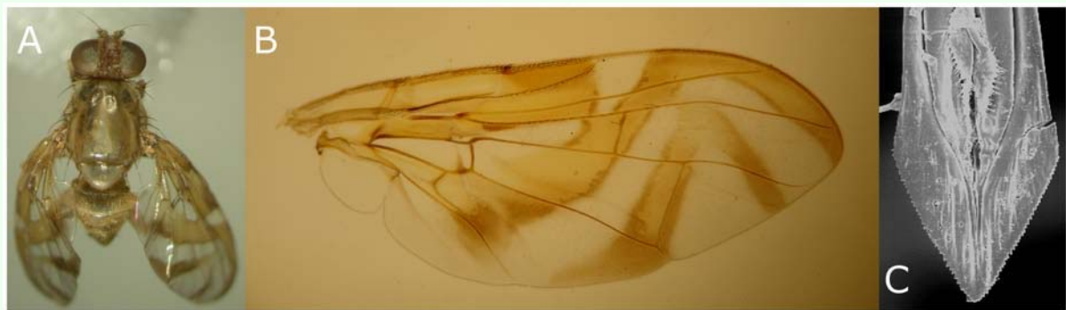
Figure 2. Anastrepha nascimentoi : female (a), wing (b), aculeus tip (c).

mainly associated with Euphorbiaceae and Olacaceae (Norrbon et al. 1999). Thus, these findings reinforce the hypothesis that host-plant associations of Anastrepha appear to be correlated with phylogenetic relationships within the genus (Norrbon et al. 1999). The mean fruit weight and infestation index values were 41.34 g and 0.32 puparia.g -1 for G. laeve and 13.40 g and 0.06 puparia.g -1 for C. bahiensis .