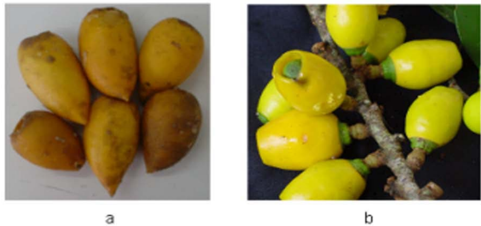
Figure 3. Geissospermum laeve ripe fruits (a), Cathedra bahiensis fruits (b).