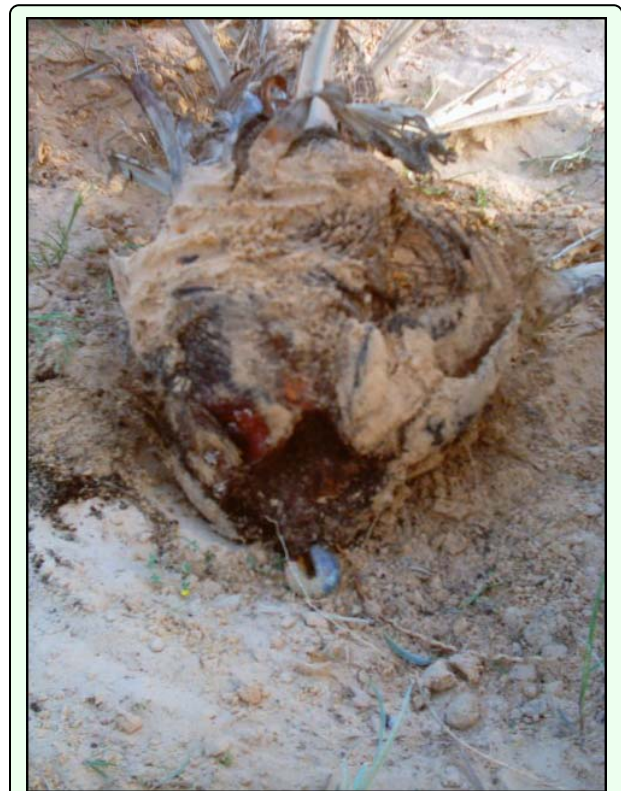
Figure 5. Offshoots attack and damage

Offshoots are used for oases extension and installation. In the Rjim Maatoug zone, the percentage of offshoot attack reached 100% in heavily infested palm plantations. Attacked offshoots showed a partial drying located on the side of the attacked part that can lead to a deceleration or arrest of development. At the end of this process, mortality of offshoots was caused by total drying, especially after separation from the mother plants. When planted, offshoots are autonomous and the drying process was accelerated. Rot installation due to high moisture generated by larvae presence can also occur (Figure 5).