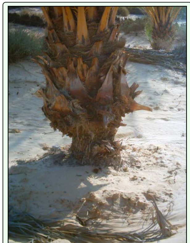
Figure 2. Aerial respiratory roots damage

of its collapse in response to the least amount of wind (Figure 2). Horizontal and epicentric destruction of the perimeter of the fibrous roots can reach the central zone represented by the conducting vessels.