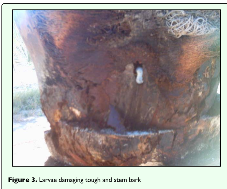
Figure 3. Larvae damaging tough and stem bark

Third instar larvae have robust mouth parts and initially attacked tough causing significant damage and creating varied geometrical forms of galleries in its layers (Figure 3). However, when groups are present in a limited space the amount of tough was insufficient to nourish these larvae during their long developmental period and consequently attacked stem bark, dry petiole and/or tough of the midrib of fronds. Larvae dug galleries on tough between the two neighbouring frond midribs. This phenomenon was frequent on the higher level of the stem situated under the crown.