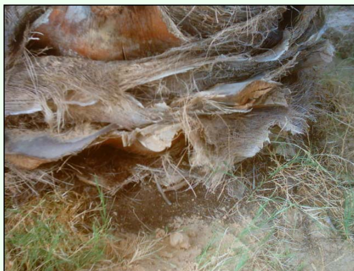
Figure 1. Powder on the ground showing symptoms of attack

Larval crowding in a confined area, especially of third instar, can lead to an overlapping and an interpenetration of these tunnels that results in the formation of larger holes from which larvae tend to dig deeper galleries. This phenomenon, repeated over several years, constitute a potential danger to the whole palm tree and can result in its base becoming unbalanced by the weakening of its basal support, and as a consequence, increasing the risk