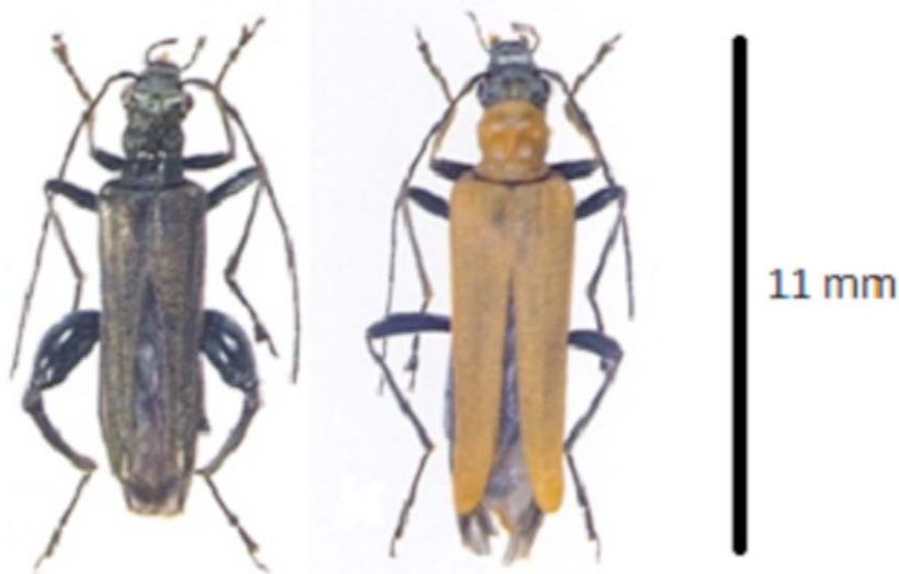
Figure 2. Male (Left) and female (right) of Oedemera podagrariae ventralis Meineitrieas. High quality figures are available online.