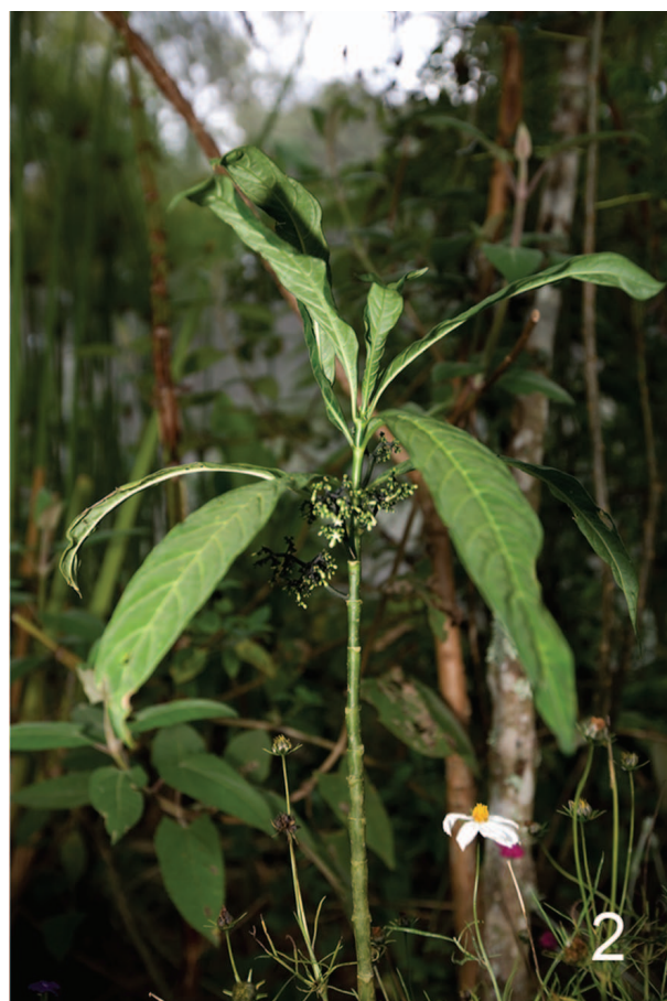
Figure 2. Notopleura macrophylla , host plant of Mesosemia mevania .

Habitat and food plant. The study area is principally made up of large pine plantations surrounding small fragments of native forest, dominated by Quercus humboldtii . This area corresponds to the lower montane moist forest (Im-MF) life zone (Holdridge 1987).