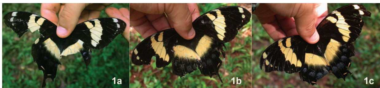
FIG. 1. Photographs of Papilio homerus used for image analysis. From left to right, photograph #3889, 4060, and 3794.

used to outline the wing as the presumed shape of an undamaged wing while erasing the remainder of the background. The image was cleaned using the Erase tool so that only the wing remained for analysis. Photographs of undamaged wings were used as a template when outlining the presumed shape of an undamaged wing on a wing with damage. The image was then saved as an undamaged wing JPEG file as a high quality image (10) with the format option set as baseline standard. The undamaged wing file was reopened and the Erase tool was used to outline the actual damaged wing, which was then saved as a damaged wing JPEG file. Both images were grayscale by selecting the Image tab, then choosing the Mode option, which leads to the Grayscale option. The grayscale images were saved as TIFF files.