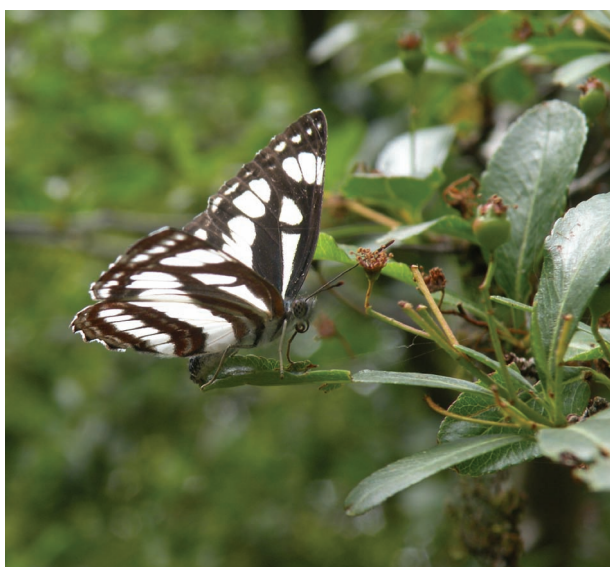
FIG. 2. A female Neptis mahendra ovipositing on Pyracantha crenulata .

Description: Forewing length: 18–29 mm. Expanse: 48 mm. Dry Season Form: Head, thorax and abdomen unmarked fuscous, iridescent under artificial light; antennae with tip of nudum brown. Recto surface of wings with ground colour black. Forewing cell streak clear white, discocellular bar faint, streak beyond cell wider than cell streak at discocellular bar; upper postdiscal band consists of 4 spots, the 2 costal spots reduced to small streaks; lower postdiscal band complete; postdiscal fascia obscure; submarginal series on an