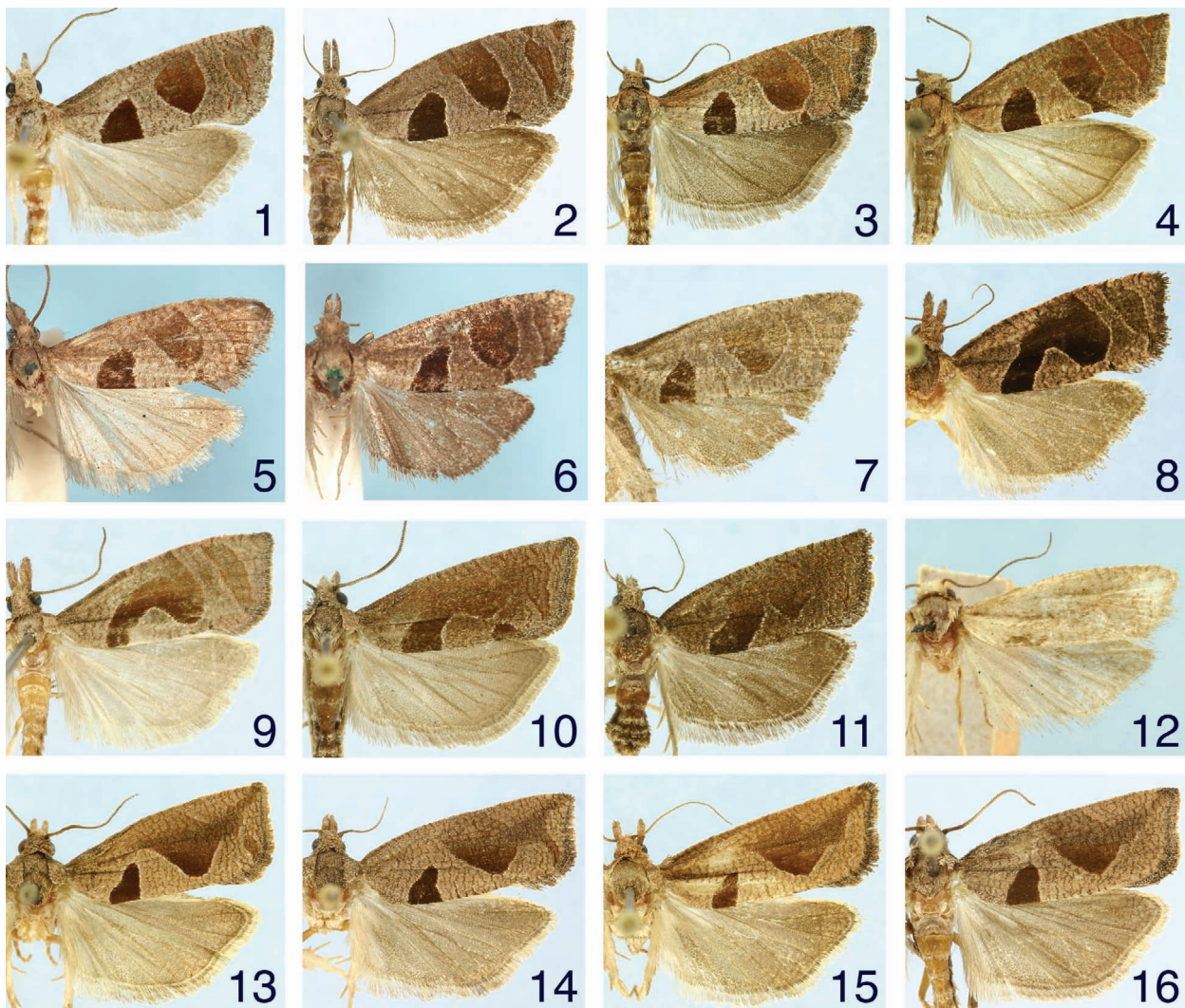
FIGS. 1–16. 1–7, E. dorsisignatana . 1, ♂, Adams Co., Ohio. 2, ♀, Ithaca, New York. 3, ♂, Larimer Co., Colorado. 4, ♂, Halifax, Nova Scotia. 5, P. clavata lectotype. 6, C. distigmata holotype. 7, E. d. diffusana lectotype. 8–9, E. similiana , form confluana . 8, ♀, Hamilton Co., Ohio. 9, ♂, Susquehanna Co., Pennsylvania. 10–11, E. similiana , form diffusana , ♂, ♂, Hamilton Co., Ohio. 12, E. engelana , lectotype. 13–16, E. oraria . 13, Holotype. 14, ♀, Accomack Co., Virginia. 15, ♀, Northampton Co., Virginia. 16, ♂, Worcester Co., Maryland.