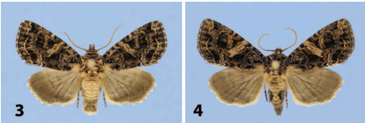
FIGS. 3-4. 3) Hadena ectypa , adult male, reared in 2009. Wingspan 28.5 mm. 4) Hadena ectypa , adult female, reared in 2010. Wingspan 30.0 mm.

The Knightville WMA was revisited on 15, 18, and 20 July 2010. On 15 July 2010, at the same site where Hadena ectypa was found on 28 July 2009, five large Silene vulgaris plants were thoroughly searched, with hundreds of flowers examined. A total of 25 Hadena ectypa larvae were found (two in the second instar and 23 in the third instar), as well as seven shed head capsules (one from the first instar and six from the second instar), and two empty eggshells (both inside the same flower). Two second instar and six third instar larvae were collected for rearing. On 18 July 2010, the river banks to the north were searched, but the only sign of Hadena ectypa was a single empty eggshell on one of six S. vulgaris plants about 800 m north of where Hadena ectypa was found on 15 July. On 20 July 2010, the river banks to the south were searched. At one site