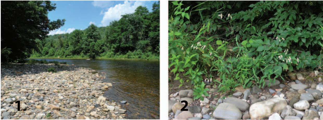
FIGS. 1-2. 1) Habitat of Hadena ectypa at the Knightville State Wildlife Management Area, town of Huntington, Hampshire County, Massachusetts, USA. This stretch of the Westfield River has a rocky substrate, with margins of accumulated cobble and sandy soils, which support a narrow strip of herbaceous vegetation between the river and the floodplain forest. Photographed 28 July 2009. 2) Bladder campion, Silene vulgaris , growing on the sandy river bank behind the cobble bar in Fig. 1. Hadena ectypa was collected from this plant. Photographed 28 July 2009.

bank behind a cobble bar. The habitat (Fig. 1) and S. vulgaris (Fig. 2) were photographed at this location. Most of the S. vulgaris flowers were just past peak, with petals still present and ovaries small and green. Careful examination of flowers at this stage revealed the presence of Hadena ectypa : four first instar larvae, each in its own flower, and two unhatched eggs, both laid on the ovary of a single flower. All four larvae and both eggs were collected for rearing. Also observed on 28 July 2009 were a number of small syrphid flies (Diptera: Syrphidae), including one mating pair, on and around the S. vulgaris . In addition, syrphid fly larvae were observed on the S. vulgaris flowers. On 3 August 2009 the Knightville WMA was revisited in order to determine if the Hadena ectypa population extended further to the south of areas explored previously. At a site on the west bank of the river, approximately 2.6 km to the south of where Hadena ectypa was found on 28