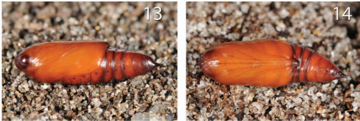
FIGS. 13-14. 13) Hadena ectypa , pupa, lateral. Length 16 mm, width 5.0 mm at third abdominal segment. Photographed 20 August 2009. 14) Hadena ectypa , pupa, ventral. Length 15 mm, width 5.0 mm at third abdominal segment. Photographed 7 August 2010.