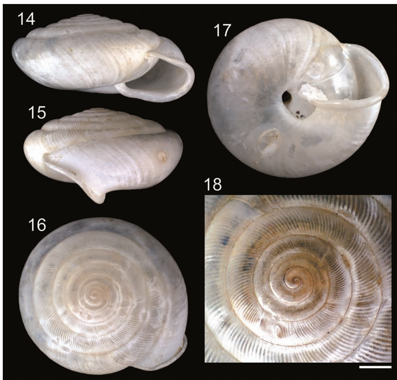
Figs. 14–18. Streptaxis leirae sp. nov. Holotype, MZSP 129247 (H = 6.8 mm, D = 13.5 mm). The scale bar (= 1 mm) refers only to the close-up image of the protoconch and first whorls.

growth). All of the present specimens were collected under bushes in a dune area, indicative of a dry sandy habitat for this species. The present record greatly extends the species' range to the east.