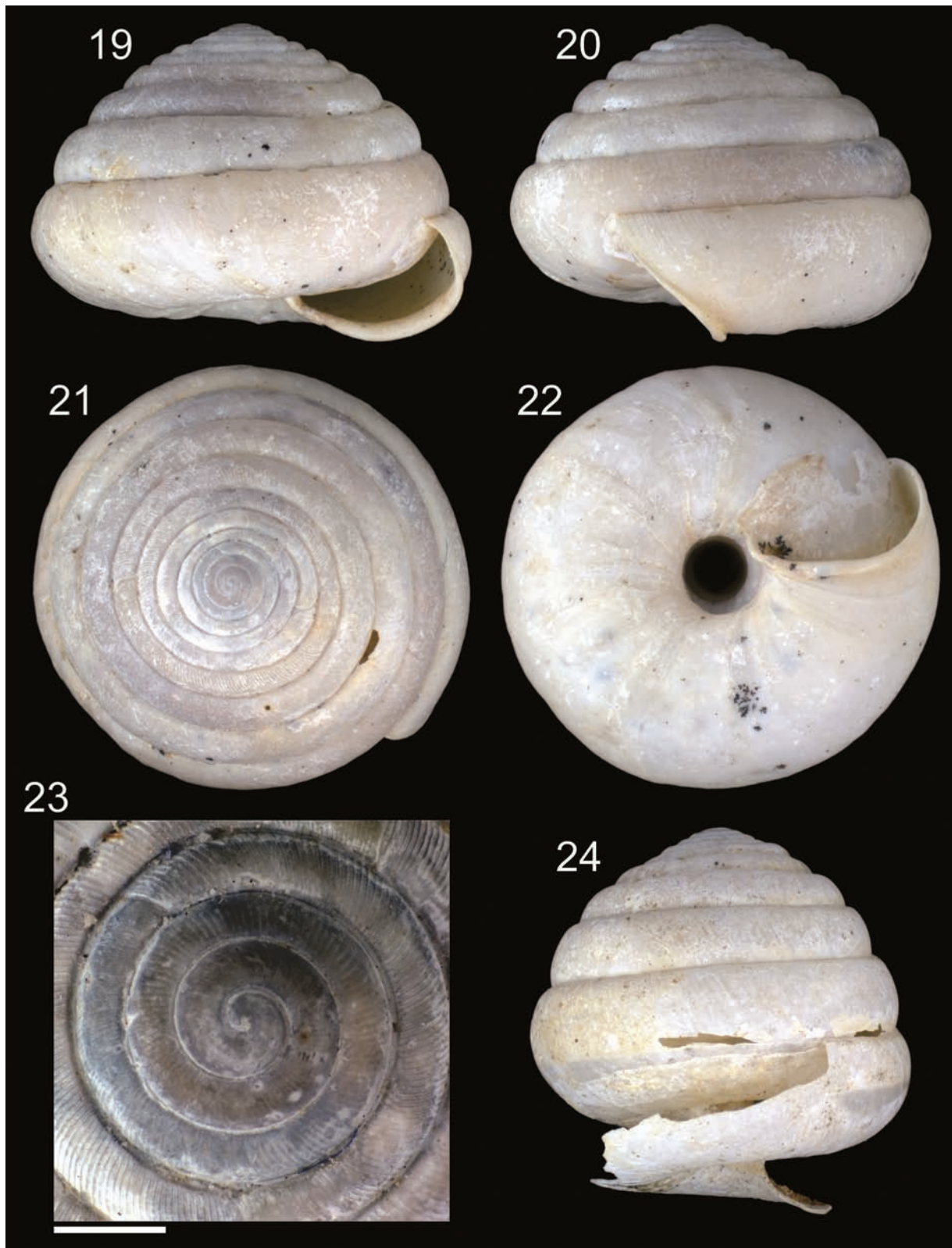
Figs. 19–24. Streptaxis megahelix sp. nov. – 19–23. Holotype, MZSP 124024 (H = 13.5 mm, D = 18.1 mm). The scale bar (= 1 mm) refers only to the close-up image of the protoconch and first whorls. 24. Paratype (fragmentary), MZSP 124024 (H = 16.0 mm, D = 15.8 mm).