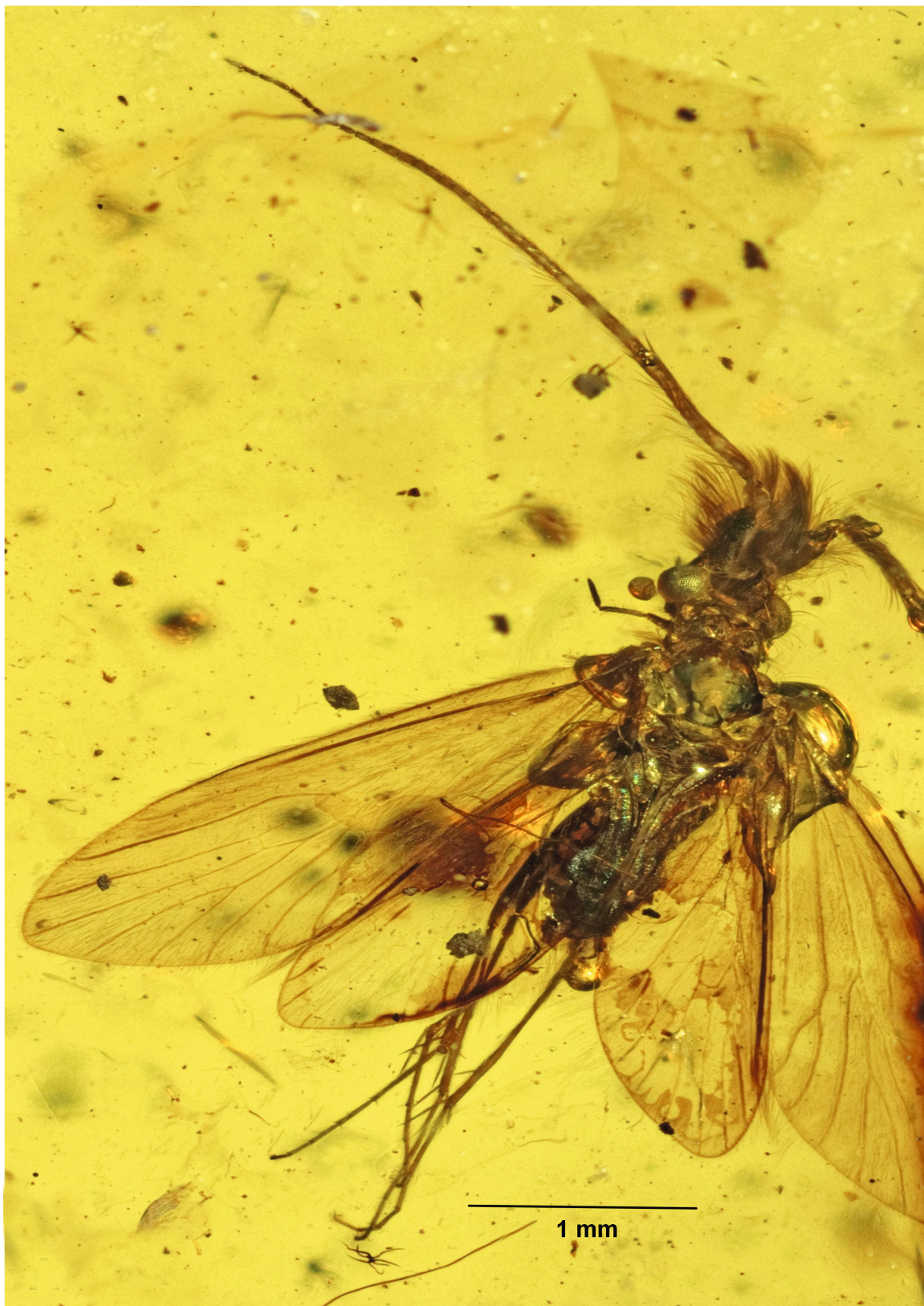
Fig. 1. Burmapsysche wolframmeyi sp. nov. embedded in mid-Cretaceous Burmese amber, holotype, deposited in Systematic Entomology Collection of Hokkaido University Museum, Japan, SEHU: 54024.