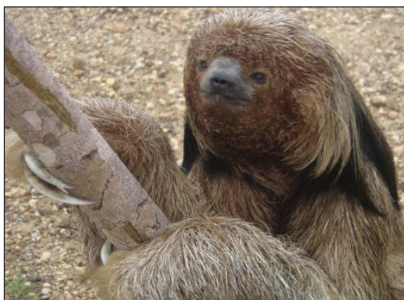
Figure 2. Adult Bradypus torquatus from Fazenda Trapsa, Sergipe, Brazil.

Additionally, at least two sloths are known to have been captured by local residents during the past year