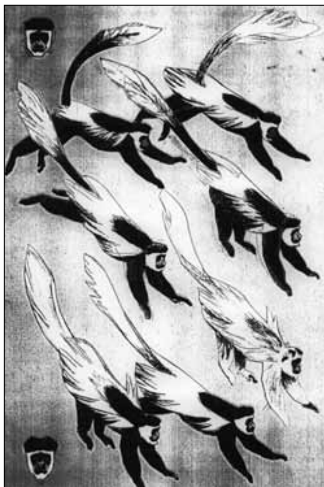
Sketches by Pierre Dandelot. Black-and-white colobus leaping. Original with Colin P. Groves.