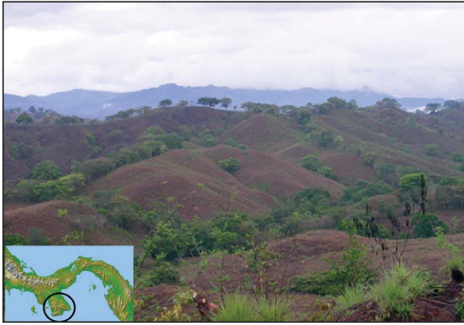
Figure 1. The Azuero landscape, showing cattle pastures bordered with living fences, one of the remaining vegetation types where it is still possible to find native primates.

institutions (Ruiz-Bernard et al. 2010). Each year, different strategies were adopted for these surveys, including the following.