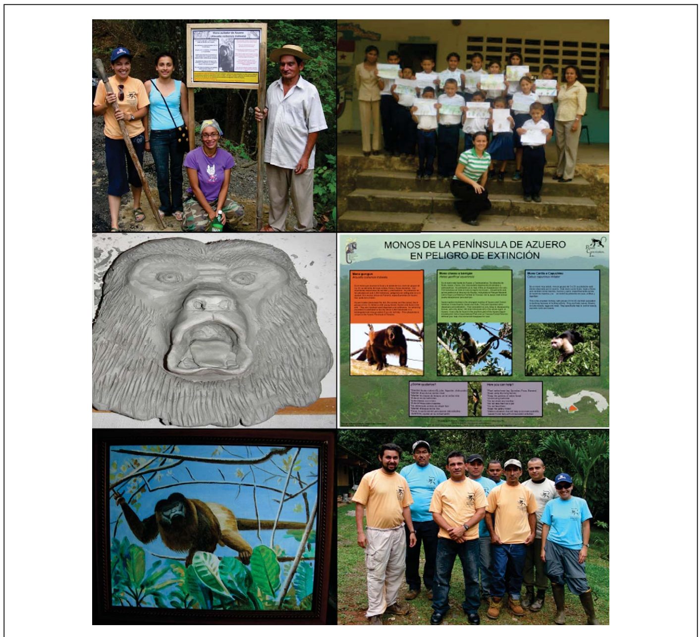
Figure 2. Environmental education activities developed for the Fundación Pro-Conservación de los Primates Panameños-FCPP, Azuero Peninsula, Panama. These include the following: road signs, informative talks to primary and secondary schools, creating educational tools such as masks and paintings related to the primates and their habitat, informative posters, and educational talks with the forest rangers of the reserves.

Most of the younger generation in northeastern Azuero now use the internet. Secondary school students who are very familiar with the internet are now less familiar with the primates living in their own town. FCPP has posted videos with topics related to environmental education on <youtube.com>. This is done every year to keep the students and the general public informed about the fauna and flora in the region. By viewing these videos the students can also learn about our activities around the peninsula. Newspaper articles providing general information related to this project and the Azuero primates are also important. This information is accessible to the local community where we work and encourages the conservation of the fauna and flora in the region (Fig. 2).