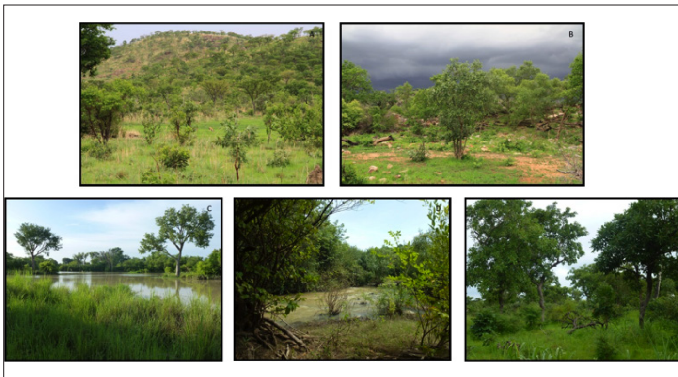
Figure 2. The typical habitat types of the five protected areas surveyed: (A) Pama Partial Reserve, (B) Arly National Park, (C) Nazinga Game Ranch and Reserve, (D) Comoé-Léraba Partial Reserve, and (E) Koulbi Protected Forest.

We collected data between 11 May and 16 July 2012 through reconnaissance (recce) surveys. Recces follow paths of least resistance, covering only new ground; they provide the ability to survey four times more land than line transects (Walsh and White 1999). During the recces, we walked at