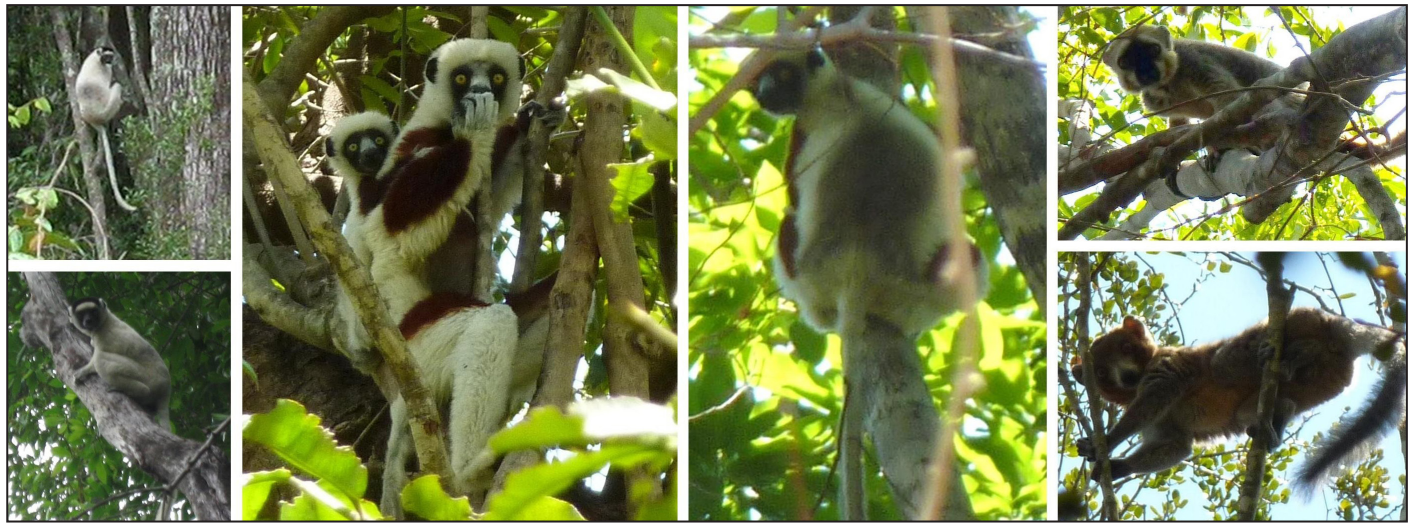
Figure 4. P. verreauxi at Analakinganala, P. coquereli at Betonendry/Maroakanga, Eulemur rufus at Ikay, and E. mongoz at Anaboazo.