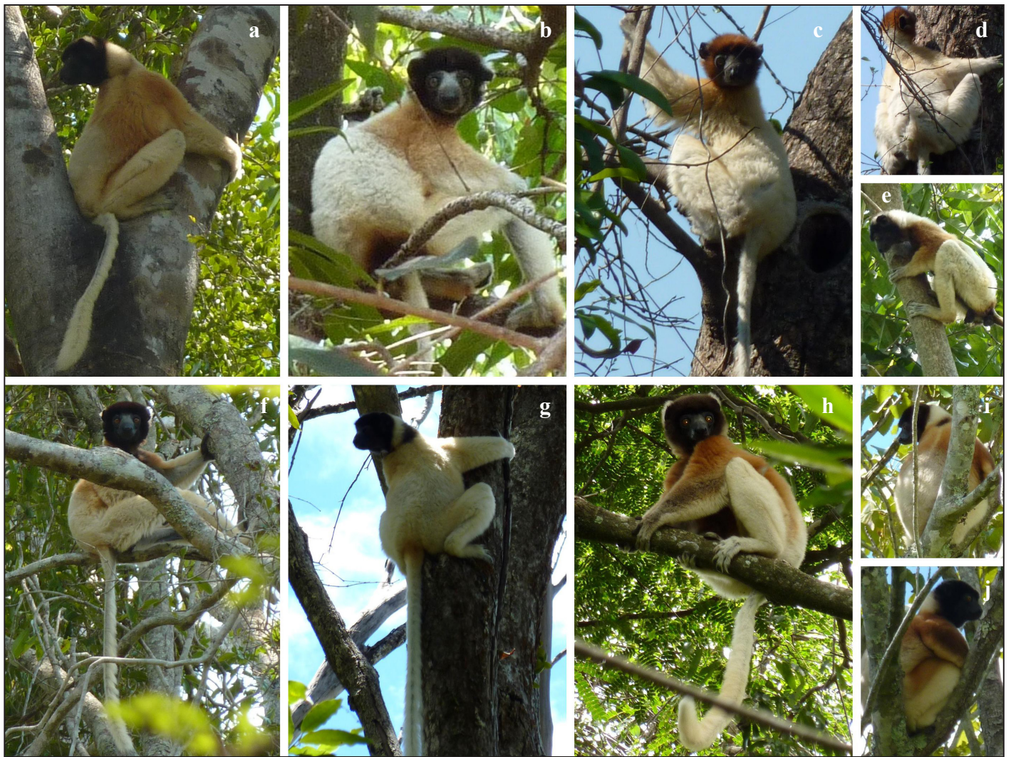
Figure 2. Chromatic variation of P. coronatus at the survey sites from the Boeny and Betsiboka regions (top line) and the Bongolava Region (bottom line): Anaboazo (a), Ikay (b and e), Mandrava (c and d), Ambohitromby (f), Mahajeby (g) and Andasilaikatsaka (h-j).