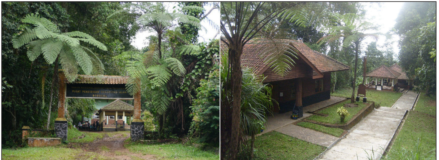
Figures 2 and 3. The Bodogol Conservation Education Center.