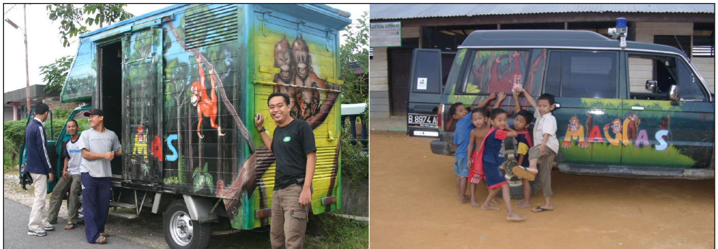
Figures 10 and 11. Vehicles used to visit villages and schools.