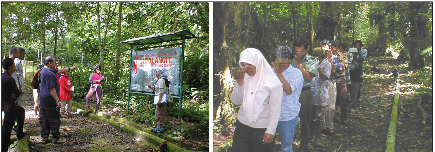
Figures 8 and 9. Activities at the Sibolangit Interpretive Education Center.

The Mobile Education Unit was an integral part of the conservation education work in North Sumatra, and it also provided an important entry point for reaching local decision makers. Interpreters play a very important role in conservation education throughout the world, and through them, the public comes to understand nature and its role in supporting their livelihoods. Interpreters have the skill to communicate and translate the technical facets of the environment and its interactions in non-scientific terms in a clear and comprehensible manner. Good interpreters are as such a key component of successful conservation education programs. The training materials for interpreters include the basics of ecology for nature guides or interpreters, conservation games, the basics of nature interpretation, communication for nature guides and interpreters, the identification of the flora and fauna, jungle survival, and practice in the field.