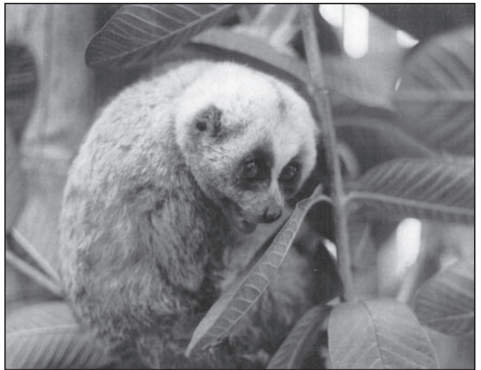
Photo 4. The slow loris, Nycticebus bengalensis , is being hunted for wildlife trade throughout its range in Asia.