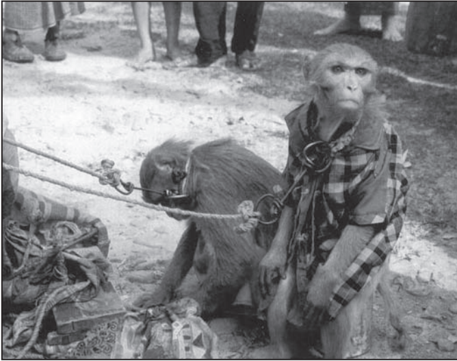
Photo 1. Rhesus macaques, Macaca mulatta , are captured young and trained to perform at roadside shows by charmers.