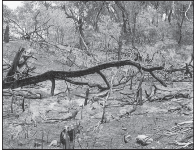
Photo 2. Golden langur habitat near Ultapani (Chirrang Reserved Forest) cleared for cultivation.