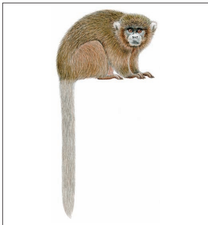
Figure 5. Revised illustration for C. modestus . Illustration by Stephen D. Nash.

The pelage color of most of the individuals of Group 6 was similar to that of Groups 1–3 in that they had a rufous non-agouti back and chest, creamy under-parts, and a pale throat, although they resembled Groups 4–5 by having conspicuous white ear tufts and pale hands. One distinctly colored individual in this group appeared lighter and possibly had grey-red agouti fur on the back. All individuals of Group 6 also had a denser layer of white hairs on the face and a whitish anterior base of the tail.